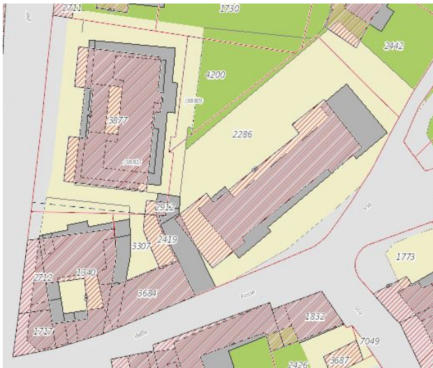
Figure 2. Misalignment between buildings in TDB and buildings in the cadastral map

Another critical issue concerns the cadastral map and the possibility to spatially relate the cadastral map with other spatial datasets, especially the TDB. The cadastral map is the georeferenced component of the land registry and it is realized in the historical National Coordinate System “Roma Monte Mario”. Nevertheless this geographic layer is not directly interoperable with the TDB geometries: these two cartography, realized in different times, with different methods (airborne photogrammetry for the TDBs and topographic survey for the cadastral map) and with different purposes are currently misaligned.