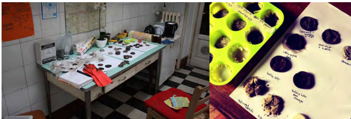
Figure 5. Our material creation environment.

The students were asked to design a product with the given material concept by using the given technical data sheet and materials experience patterns; thus the ultimate product was expected to express the meanings ‘provocative’ and ‘modest’. In total, five product ideas for each material concept were created. Some of the ideas were for products concerning a ‘coffee ritual’ (i.e., drinking or making). In most cases, there existed a strong link to nature. The aesthetics of the material, such as its dark brown colour, imperfect patterns, and texturization, were used to