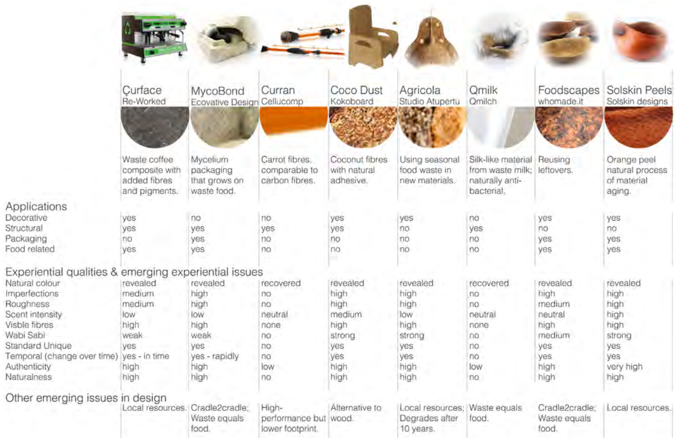
Figure 3. Material Benchmarking for food-based composites.

Accordingly, in Step 2 of the MDD Method, first the designer is expected to encapsulate and reflect on the overall material characterization. The questions to be answered in the creation of the Materials Experience Vision can be listed as follows: