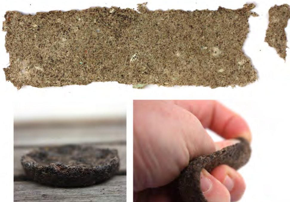
Figure 6. Three selected samples to be used in the product concept creation: CapPurcino (below left), Cofflexi (below right), and Café Maché (above).

Accordingly, we developed our final product concept using two of the material concepts (Zeeuw van der Laan, 2013). It is a set to grow greens at home, Cof2Grow (Figure 9). Café Maché was