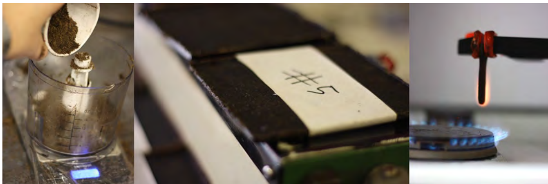
Figure 2. Tinkering with the material: varying the amount of coffee grounds in different samples to be subjected to mechanical tests (left and middle); fire resistance test (right).

In the experiential characterization of the material, first we recommend the designer should reflect on the experiential qualities of the material on four different experiential levels: sensorial , interpretive (meanings), affective (emotions), and performative (actions, performances) (Giaccardi & Karana, 2015). Then, he/she should delve into understanding how the material is received by people, again by using the four experiential levels as a foundational structure. For example, reactions may be recorded such as 'wow' (affective), 'it is strange' (interpretive), 'it is very soft' (sensorial), as well as observations that people may tweak the material, pat it, smell it, etc. (performative). Designers should tinker with the material to create samples of varying form (e.g., rounded, amorphous) and sensorial qualities (e.g., rough, elastic), and to collect substitute materials (in case of a not fully developed material) which would potentially elicit contrasting or complementary experiences in any or all of the four experiential