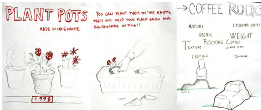
Figure 8. Two of the created ideas of the creative session.