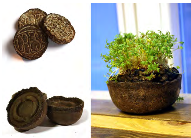
Figure 9. Final product concept ‘Cof2Grow’ (right) consisting of a tablet made of Café Maché, which contains seeds of preferred greens (left above); a pot made of CapPurcino, which will change over time slowly due to the influence of UV and touch (left below).

used for the packaging as well as a nutrient for tablets that contain seeds of preferred greens. The seeds sprout rapidly after adding water and the coffee grounds provide nutrients. The material changes quickly due to the growth inside, and after the seeds are fully grown and consumed, the entire tablet can be disposed of as organic waste. The tablets come with a pot that is made from CapPurcino, which can be reused. Taking into account the natural course of maturing of the material, it will change over time slowly due to the influence of UV and touch. Anticipating the process of curing the material, the pots are designed to have unique design features (e.g., different textures, different colour tones, etc.) for each cast. The product concept was carried to the next step to be tested in the lab and in the field, before final embodiment and detailing were completed.