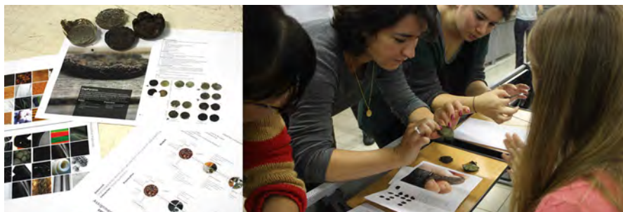
Figure 7. The material package used in the creative session.