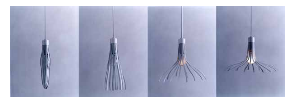
Fig. 1. Hanabi lamp designed by Oki Sato for Nendo. The lamp made of shape memory Nitinol alloy "blooms" when it is warmed up by the heat of the light bulb.