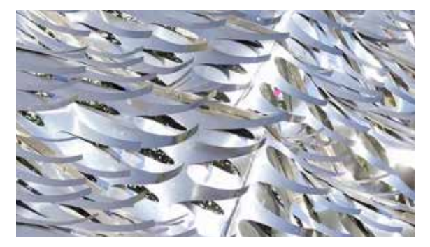
Fig. 4. Bloom skin detail, an architectural research installation displayed at the Materials and Application Gallery in Los Angeles, 2011.

Bloom is a climate-controlled pavilion made out of about 14000 laser cut pieces (Fig. 4). The surface of this floor-to-ceiling installation acts as a sun tracking system that indexes time and temperature. When the temperature rises above 22°C, the metal sheets curl up and when it gets cooler, the sheets flatten out. This smart solution is useful to balance internal heat accumulation, improving the comfort level of the space. It reduces the need for airconditioning and saves energy, without the need for manual controls or additional power. "In houses now we don't need drapes or blinds" says the architect [13].