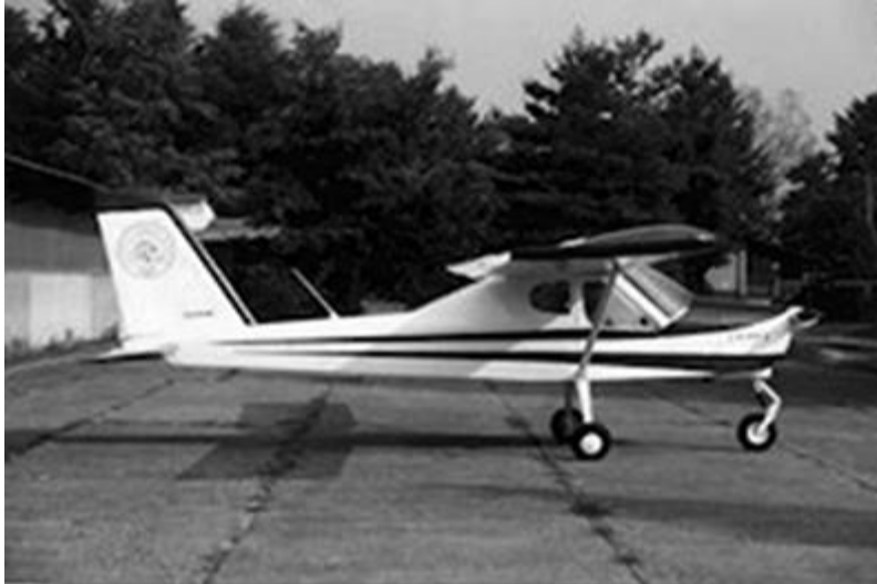
Figure 1: The DSTA-POLIIMI P-92 Echo ultralight airplane.

Up to 2008, the P92 was used to perform the flight test missions of the “Flight testing” course. Indeed, such an airplane is fully representative of typical fixed-wing, heavier general aviation aircraft such as those falling in the CS-VLA or FAR/CS-23 type certification, save for the costs of operation and maintenance, which are substantially lower, allowing to establish a sustainable, recurring activity over the years.