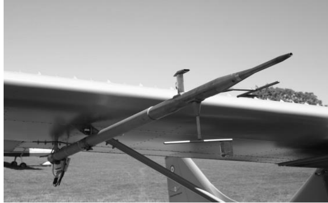
Figure 3: The FTI pitot boom installed below the “Trial” right wing.

The 2014 flight test campaign involved a total of 15 flight test missions, carried out during 4 afternoons. No repetitions were necessary. Each mission had a duration (from engine start to engine stop) between 41 and 60 minutes, with an average of 48.5 minutes. Two aircraft versions have been tested, one with a clean wing, and another with a wing fitted with vortex generators (VGs) close to the leading edge, on the upper surface. Half of the teams were assigned to a number of topics on the clean airplane, while the other half performed the same studies on the aircraft fitted with VGs. The specific topics, in addition to take-off and landing performance, are listed below for each team: