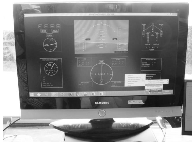
Figure 5: The Ground Station main monitor, showing the airplane’s flight instrument readings supplied by the telemetry link.

As anticipated, the DSTA-PoliMI team involved in the “Flight Testing” course is currently working on the planning, execution and post-flight analysis related to the LTF-UL certification campaign for the new ULM model designed at Ing. Nando Groppo Srl. In this circumstance, the newly-developed telemetry system and GS are being used together with the “Mnemosine” FTI system in order to collect the necessary data. The GS interface provides the real-time cockpit-like view of on board flight instruments (Figure 5), as well as the typical paper strip-like visualization of the time histories of all sensed parameters. Apart from its general usefulness in monitoring the test point quality in real-time from the ground, it is expected that the telemetry capability will be especially advantageous in all the test missions flown at minimum weight, and therefore without the FTE on board. In those cases, the FTE will be operating the GS while keeping constant radio communication with the pilot, in order to support the test point achievement.