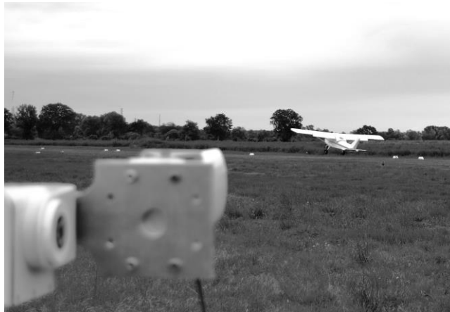
Figure 4: The NG “Folder” at touchdown, closely followed by the telemetry antennae (on the left).

The ground infrastructure is completed by a weather station that acquires air temperature, pressure, relative humidity information, as well as wind intensity and direction, and conveys it to the GS via the cited 802.11n link on the 5 GHz band.