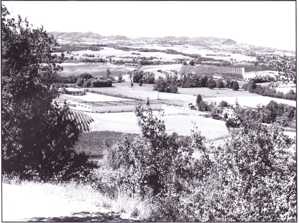
Figure 13.2 A view of Monferrato Casalese.

The Politecnico consultancy, uses a research-based approach to support different projects, such as organizing and connecting local information systems on the built resources, foreshadowing scenarios related to institutional development projects, and providing local communities and associations with tools to support their case in negotiating with developers and central authorities. The main objective is to promote information among the inhabitants about short and long term consequences of interventions, especially those affecting the environmental aspects that concern the notions of 'landscape' and 'landscape protection'. People only protect the things that they take ownership of. For this reason, three main questions were identified for Monferrato Casalese: