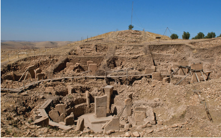
Fig. 1 Göbekli Tepe, the megalithic enclosures, view from the east.

Neolithic A) period. Superimposed to this layer is Layer II. The Layer II monuments are smaller, almost rectangular rooms often containing two considerably smaller central pillars. These structures are archaeologically dated to the early and middle PPNB (Pre-pottery Neolithic B). The whole site was apparently frequented for a couple of millennia, and then backfilled with earth, stones and rubble before being abandoned. For reasons that are unclear, in fact, this sacred place was meticulously buried, filled in so efficiently as to preserve it as a time-capsule for posterity.