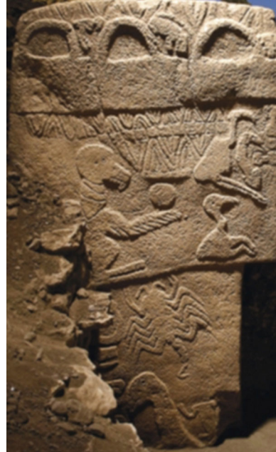
Fig. 4 Göbekli Tepe. The carvings on Pillar 43.

not so remote from Göbekli. However, birds, and the vulture in particular, have also been repeatedly associated with the sun in many cultures (an obvious case being ancient Egypt) (Rappenglueck 2009). For this reason, the scene might represent the “birth” of Sirius, borne aloft by the sun. An hint that the day may be the summer solstice comes from the fact that at the end of the tenth millennium BC the summer solstice was on the point of leaving Scorpio and the rising sun was therefore just above the head of the animal. As a consequence of course Scorpio was invisible at the solstice, being just below the horizon, under the sun: in a sense Scorpio was in the realm of the dead, as indeed it is on the stela, along with a decapitated man, in the register beneath the main scene. It goes without saying, however, that we cannot be sure that the ancient builders recognized the constellation Scorpio in the sky as the Babylonians (and consequently the Greeks, the Romans, and us) did much later, so this proposal must remain at the level of a suggestion.