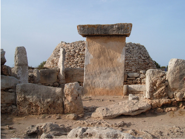
Fig. 2 Menorca. The taula at Trepuco, built around 1000 BC, some 8000 years later with respect to Göbekli Tepe. In spite of this, the similarity is impressive.

These are oval-shaped enclosures centred on a huge, T-shaped object (commonly referred to as a Taula) composed by a huge pillar and a transverse capital. Such sanctuaries were very probably oriented to the brilliant stars of the southern sky, those of the Crux-Centaurus group, which were slowly disappearing from the Mediterranean sky due to precession (Hoskin 2001). Is it possible that a similar situation—a stellar reference slowly drifting due to precession—was present at Göbekli as well?