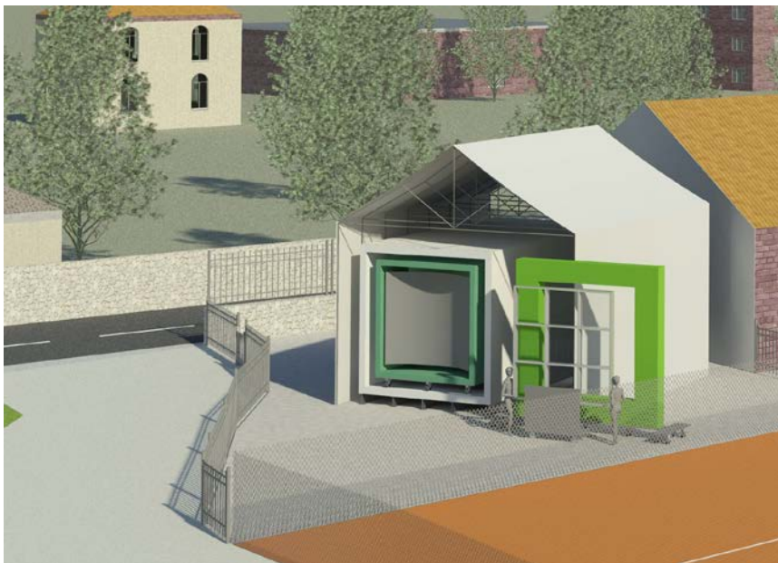
Figure 1. A 3D perspective of the new test cell facility under construction at ESTP (Paris)

A broad variety of complex building envelope components have entered the building construction market during the last decades [1]. These elements are often characterized by a dynamic response to the outdoor climate and by features which can be adapted to the local climate, to the building use and to the desired architectural aesthetics. Many of these components have been claimed to present high thermal performance while improving occupants' comfort conditions. In this scenario, it is of crucial importance to test and characterize correctly these elements under real dynamic weather conditions, in order to analyse their behaviour and evaluate their effectiveness in improving building performance, by means of existing or ad-hoc performance indicators. Both indoor laboratory and outdoor test cells can be used for the purpose, presenting peculiar differences that make them complementary facilities. The present paper highlights the main features of the test cell under construction at the Ecole Spéciale des Travaux Publics, du Bâtiment et de l'Industrie (ESTP Paris) within the framework of a collaboration between the end-use Efficiency Research Group of Politecnico di Milano and ESTP.