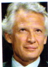
Hon. Dominique de Villepin Global Chairman of APCEO Former French Prime Minister 多米尼克·德维尔潘 亚太总裁协会全球主席 法国前总理