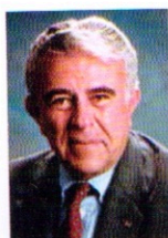
Hon. Benjamin A. Gilman Global President of APCEO Former Chairman of the House International Relations Committee, United States 本杰明·吉尔曼 亚太总裁协会全球副主席兼美洲会长 美国国会外委会前任主席