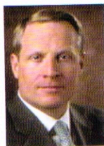
H. Ross Perot, Jr. Honorary Chairman of APCEO USA Chairman of Perot Systems 罗斯·佩罗 亚太总裁协会美国名誉主席 佩罗集团董事局主席