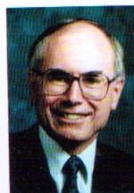
John Winston Howard Global Co-Chairman of APCEO Former Prime Minister of Australia 约翰·温斯顿·霍华德 亚太总裁协会全球共同主席 澳大利亚前总理