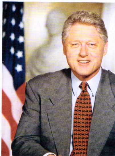
Bill Clinton The 42nd President The United States