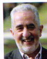
Hon. Nick Bolkus Global Vice Chairman of APCEO & Chairman of APCEO Australia, Former Minister of Australia 尼克·博尔库斯 亚太总裁协会全球副主席兼大洋洲会长 澳大利亚前内务部, 移民部部长