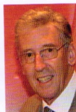
Lord Howell of Guildford Global Vice Chairman of APCEO Minister of State at the foreign Office, UK 吉尔福德·豪威尔勋爵 亚太总裁协会全球副主席 英国外交国务大臣