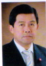
Hon. Korn Dabbaransi Global Vice Chairman of APCEO Former Deputy Prime Minister, Thailand 功·塔帕朗西 亚太总裁协会全球副主席 泰国前副总理