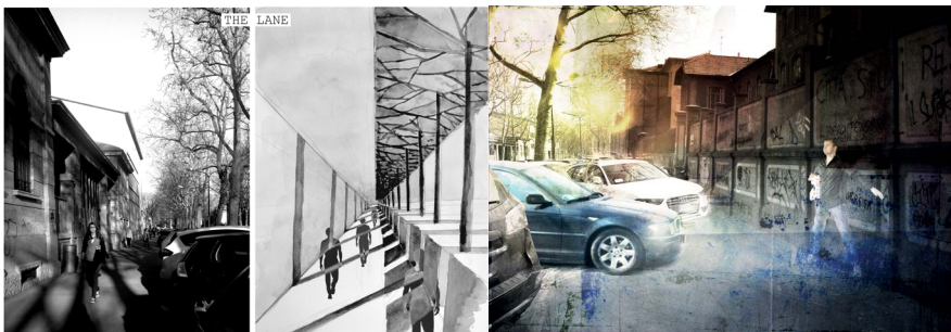
Fig. 4. Interpretations of the current condition of the street by students of A&US

The first design task was the interpretation of the place as it currently appears. Students were asked to visit the project site and to describe their feelings concerning the first urban encounter (Fig. 4). No information was given in order to let them freely perceive, interpret and depict the design area. Although the cultural and educational background of the students was various, coming from architectural, planning and social studies, some common trends in the personal experience of the place were recognizable: a sort of collective feeling emerged. For instance, the road was perceived as a merely functional space, serving in particular as an extensive parking lot and a distribution corridor of students' flows to reach the campus pavilions. In order to describe their personal sensory and emotional geographies of the place, students could use different types of media to communicate their experience, according to their sensitivity and technical skills.