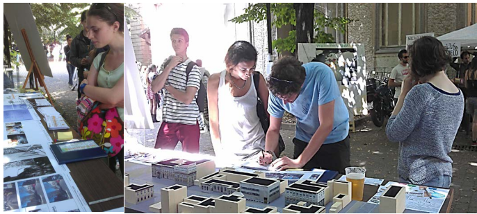
Fig. 2. Pictures of the second public event aimed at involving the student community in the process: the physical model, the questionnaire, the boards and the visuals by students