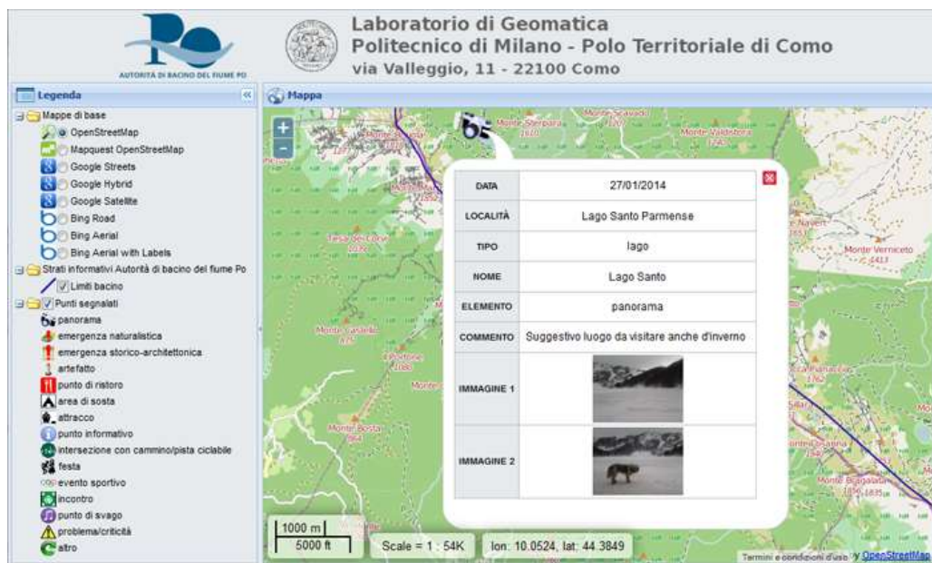
Figure 3. Web visualization and query of the water-related elements reported by users.

published as a Web Map Service (WMS) layer. Finally a Web viewer was developed through the JavaScript libraries OpenLayers ( http://openlayers.org ), GeoExt ( http://geoext.org ), and Ext JS ( http://www.sencha.com/products/extjs ) which provides intuitive access and interaction with this WMS layer representing the reported water-related elements (see Figure 3). A number of base maps served by commercial providers (OpenStreetMap, Google, and Bing) can be used as background maps within the viewer. The layer showing the boundary of Po river basin (in blue) can be also turned on/off in the layer tree. The layer of water-related elements was properly styled through the SLD (Styled Layer Descriptor) standard [16] so that different icons (the same used also in the ODK Collect form) identify the different types of water-related elements. When a reported element is clicked, a WMS GetFeatureInfo request is performed and a popup shows the information originally entered by the user during form compilation. Map browsing within the Web viewer is finally aided by some ancillary OpenLayers controls placed in the bottom left corner of the map panel, i.e. a scalebar, an indicator of current map scale and a tool displaying the coordinates of the mouse pointer as it is moved about the map.