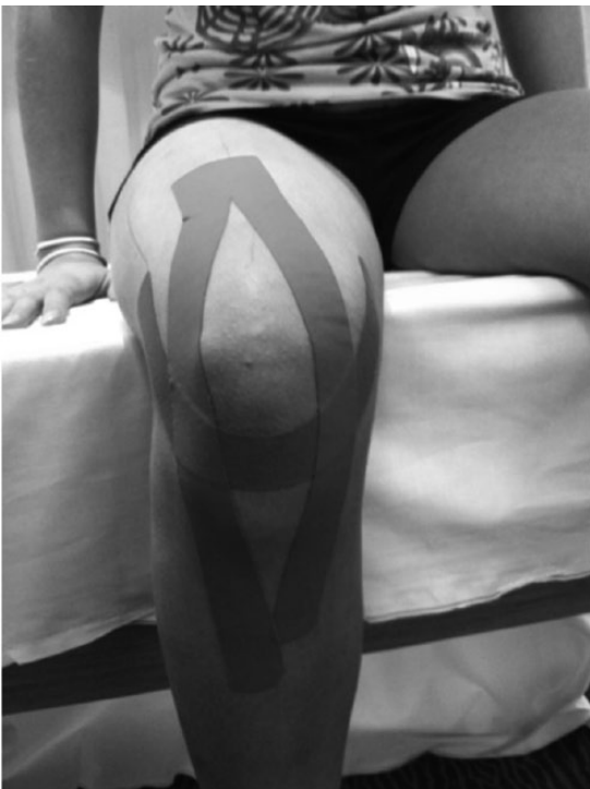
Figure 2. Taping application on the right knee.

(functional knee standard protocol treatment), a complex combination of two strips of 25 cm in length and 2.5 cm in width along the collateral ligament using 50% tape tension applied distally to proximal, a horizontal tape below the patella 25 cm in length and 2.5 cm in width applied with 25% tension and lastly a Y tape 30 cm in length