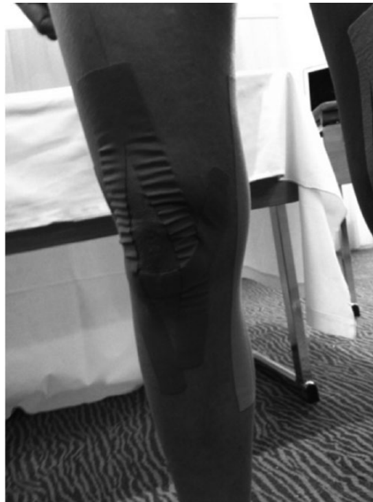
Figure 3. Taping application on the right knee.

(functional knee standard protocol treatment), a complex combination of two strips of 25 cm in length and 2.5 cm in width along the collateral ligament using 50% tape tension applied distally to proximal, a horizontal tape below the patella 25 cm in length and 2.5 cm in width applied with 25% tension and lastly a Y tape 30 cm in length