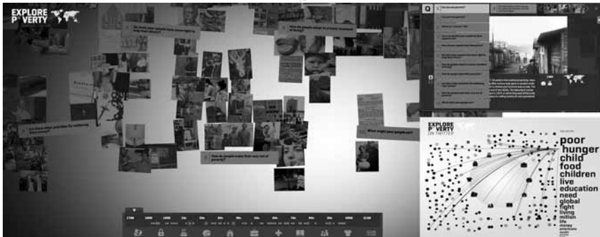
Figure 11.1 The online exhibition Explore Poverty

Note: Explore Poverty is a project by the Musée d’Histoire de la Ville de Luxembourg, in collaboration with DASA Dortmund, Helsinki City Museum, Minnesota Historical Society and realised by the Köln International School of Design.