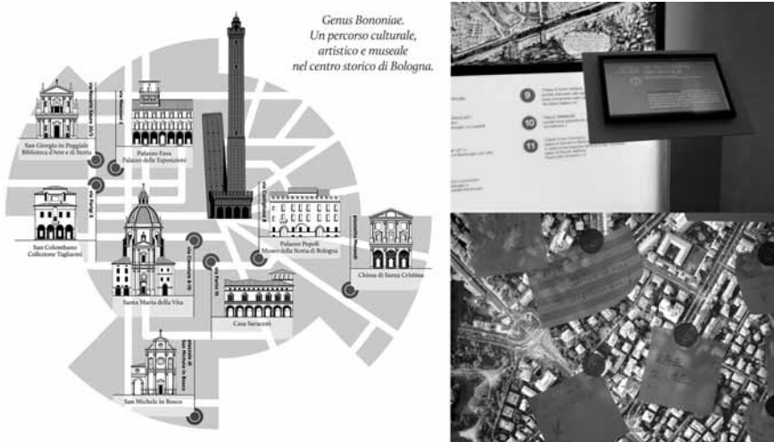
Figure 11.2 ‘Genus Bononiae’ a network museum within the city

museum that aggregates different places and complementary functions. It can be translated literally as ‘widespread museum’ or ‘diffused museum’ but probably the most accurate translation would be ‘network-museum’. Traditionally speaking, it has a main base and a collection, but is not constrained by them; it is, in fact, the main nexus of a network of local cultural resources. This network is not merely a partnership agreement but rather a widespread cultural system of different cultural places that include not only other museums, cultural services and institutions (such as libraries, schools, universities), but also archaeological and historical sites, records and evidence of local material culture, industrial remains and any kind of resource which is relevant to the cultural life and identity of the local area. Moreover, by implementing, exploiting and enhancing the local heritage as a rich, integrated network, the museum also performs the role of ‘access portal’ to the region, making the most of local resources (including both promotional and tourism perspectives) in a fruitful collaboration between public and private institutions.