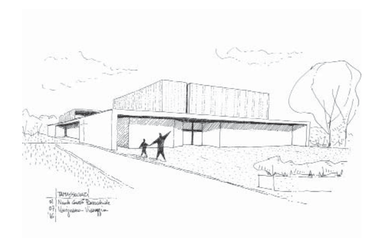
Fig. 01. Parish complex of Resurrezione di Nostro Signore in Viareggio (Italy), 2019; sketch by the architects. Fig. 02. External view. Fig. 03. Liturgical hall.