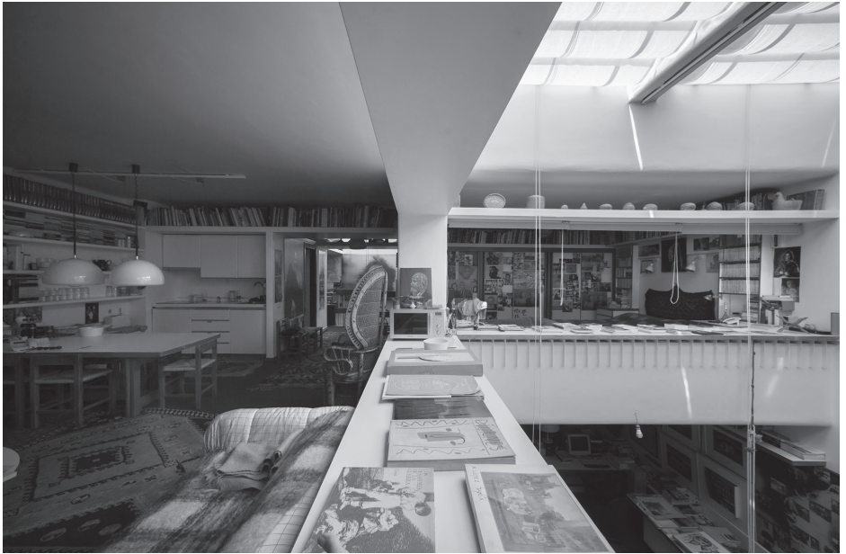
View from the mezzanine of the studio.