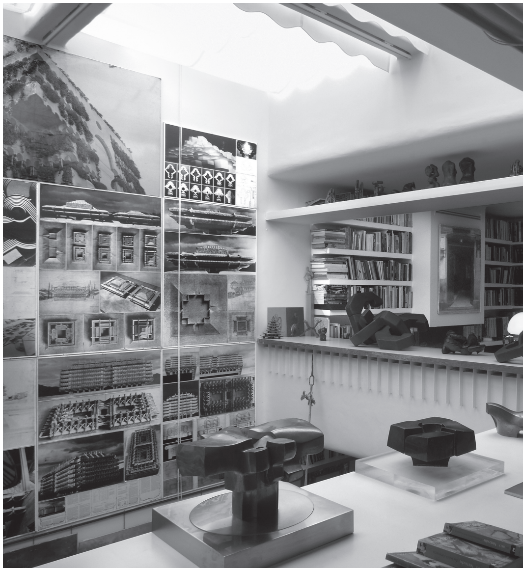
View from the mezzanine of the studio.