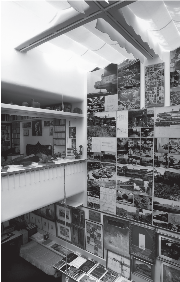
View from the mezzanine of the double-height wall.