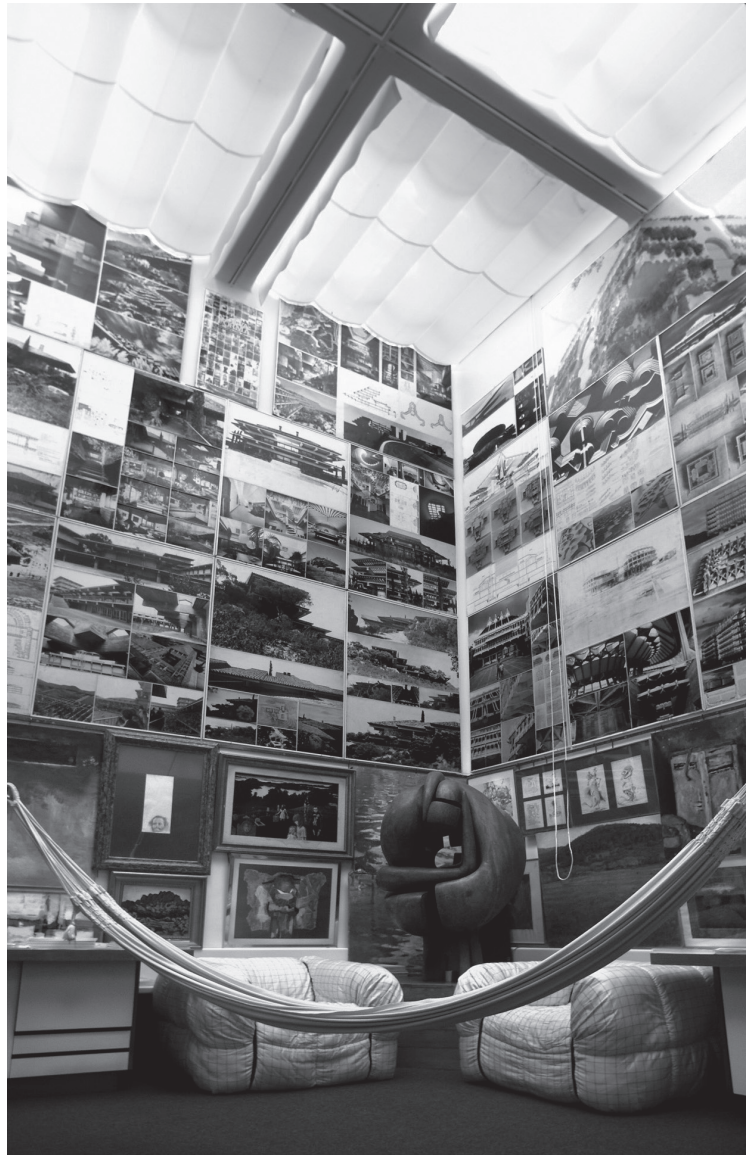
View from the underground floor of the double-height wall.