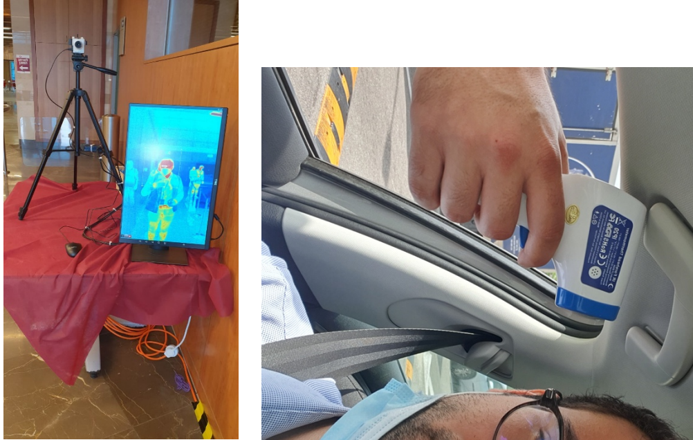
Figure 2: Point-of-contact temperature screening at the entrance of (left) a company in Israel and (right) at the entrance of the Technion Israel Institute of Technology in Haifa. Temperature may be checked using thermal imaging or non-contact infrared thermometers.