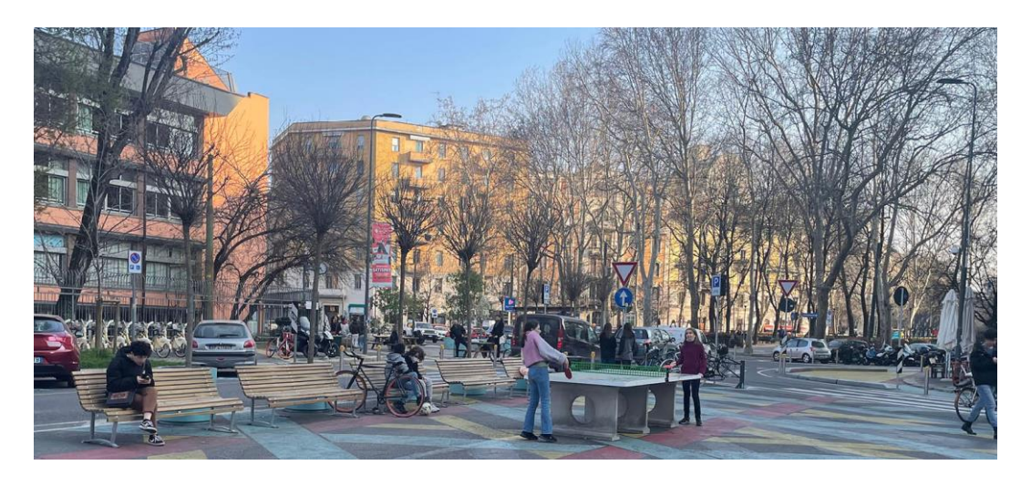
Figure 1. "Piazza Aperta" in Piazzale Bacone, Milan, ph. Valentina Labriola (2022)

It is unequivocal how the effect of the COVID-19 crisis does not affect only our private everyday life but also the way we live in the public space. However, it is possible to consider the positive impact of re-thinking the contemporary city meaning through its community places. The answer of the public administrations was usually accelerating some public actions. The Metropolitan City of Milan promoted, for example, a considerable intervention both in public space use and slow mobility.