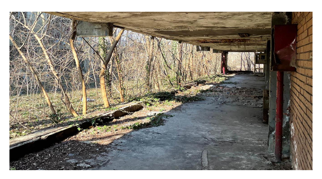
Figure 3. Istituto Marchiondi from Vittoriano Viganò, Baggio (MI), ph. Valentina Labriola (2022)

Concerning wasteland, the intention is to restore or demolish more abandoned areas as possible in the case of buildings. This action shows the usual tendency of the architecture in the design of the vacant space. The propensity is planning these spaces, trying to include them in the city through a violent transformation that denies the unique qualities of the wasteland instead. Urban voids can trigger the imagination of new alternative public spaces while simultaneously positively influencing the ever-present re-urbanization and re-naturalization process (Lopez-Pineiro, 2020). These places' ecological and socio-cultural power allows the design of a new kind of open space that considers the presence of an unseen nature. As Gilles Clément argues, "Abandoned areas constitute the principal refuge for the pioneers of exhausted, bare, 'turned over', or littered soil' (Clément, 2002, p.111). Indeed, it is visible how nature affects the voids in different aspects, firstly, in the aesthetic.