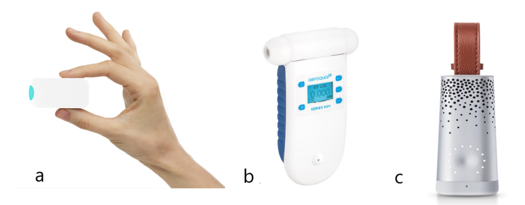
Figure 2. Three commercial products: ( a ) Wynd Air Quality Tracker; ( b ) AEROQUAL's portable air quality monitor; and ( c ) Plume Labs' Flow.

AEROQUAL [62] devices include a handheld air quality monitor, shown in Figure 2b. It exploits some sensors of GSS and others. It has a "swappable" sensor head that allows users to measure up to 30 common indoor and outdoor pollutants in real time, removing and replacing sensors in seconds. It is provided with a fan to make the air circulate.