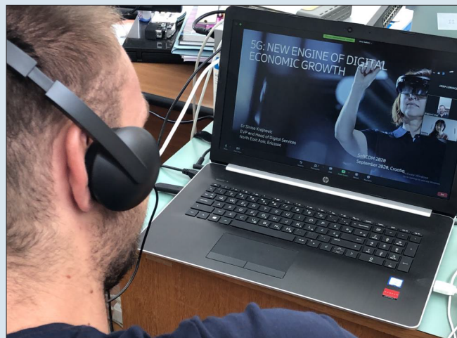
Attending the SoftCOM conference online.

The SoftCOM 2020 conference featured two events aimed at