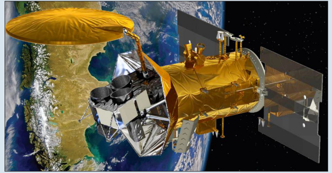
SAC-D mission was a collaboration between CONAE (Space Agency of Argentina) and INVAP, in cooperation with NASA, and space agencies of Brazil, Denmark, Italy and Germany.