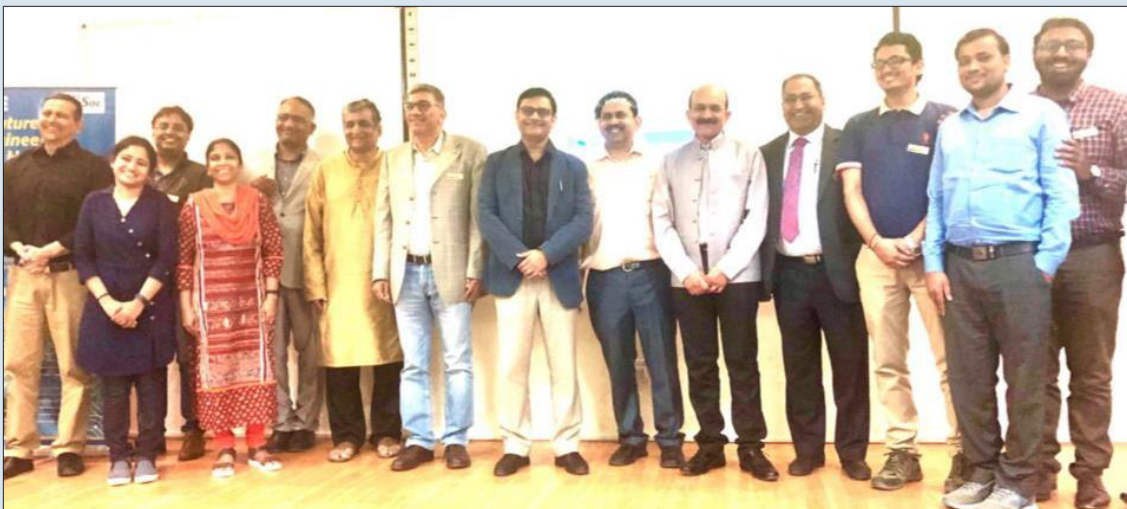
IEEE Bangalore ComSoc Chapter Execom 2020 Members whose dedication and commitment have made it possible to win CAA 2020 (APAC Best Chapter) Award.