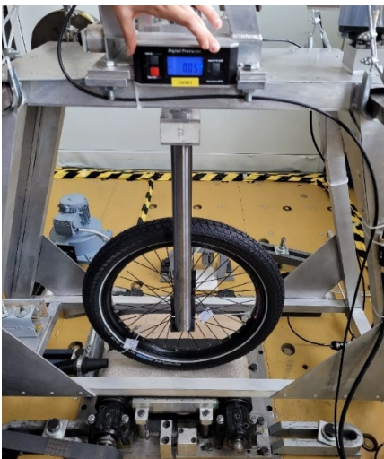
Figure 1. Test-rig VeTyT with the cargo bicycle tyre mounted on. The device was designed to ensure the proper alignment and provide an accurate measurement.

Tyre characteristics may strongly affect bicycle dynamics (Bulsink, V., 2015). This applies even more for cargo bikes as they are featured by remarkable load variation (load/unload configuration), relatively high speed and torque applied to the tyres, both during acceleration and braking phases. In this context, it is important to have a good understanding of tyre characteristics. With the aim of designing safer and higher performing bicycles, numerical models are required. Furthermore, existing mechanical models of bicycles mostly ignore tyre dynamics and need to be updated with realistic tyre models (Dell’Orto, G., 2022).