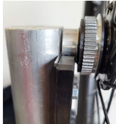
Figure 2. New steel plates for VeTyT . To accomplish with the specific dimensions of cargo bicycle wheel, new steel plates were designed and manufactured.