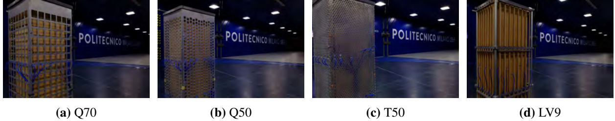
Figure 2: Experimental porous configurations tested in the wind tunnel.

The measurement setup varied according to the test phase. In the rigid configuration, time histories of total base forces were acquired via a high-frequency dynamometric balance, while the surface pressure field was mapped using 128 pressure taps distributed over 4 levels. To characterize the wake topology, the velocity field was scanned 13.5D downstream using an array of four traversing Cobra probes. In the aeroelastic configuration, the setup was equipped with accelerometers to monitor structural response. Crucially, the porous covers were instrumented with specific pressure taps to compute the net aerodynamic load acting on the envelope itself.