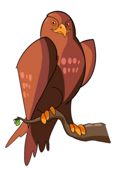
Figure 1: Falchetto, the reading domain's guide character.

In particular, the story behind Tachistoscopio is the following: Falchetto, which is responsible for the collection and safeguard of the letters in the game world, is worried because a messy anteater has gone into his nest and has caused them to flee. The player is thus required to read words before they disappear, "capturing" the fugitive letters. It is worthy to note that these characters appear in other ESSENCE games as well.