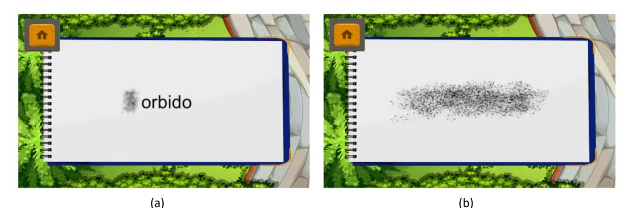
Figure 2: (a) Letter-by-letter and (b) global cancellation of words.