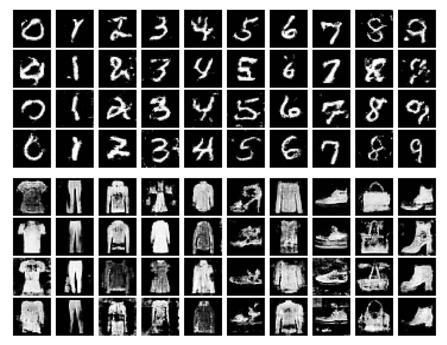
Fig. 3. Examples of synthetic data generated from SGDE generators. The first four rows are related to MNIST, and the remaining four to Fashion MNIST. For each dataset, every column contains images from a single generator trained for that specific class. It is noticeable the presence of noise in the background and the content distortion related to the differential privacy. The images are perceptually identifiable as not real and, therefore, not related to any privacy-protected real sample from a client dataset.

Table I collects the average model metrics evaluated on private validation splits from client datasets. Instead, Table III reports the metrics of the same model evaluated on the test set. Federated averaging was run until convergence, imposing the average between accuracy, F1, and AUC as validation score for the early stopping criterion.