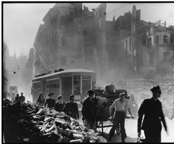
Figure 1. Ruins in Milan after the bombing in 1943 (location: inv. LV 1165)

K[3v) 4tv'3v1rr'] v̄v̄(w' '204nr' r3ir2) s'Z v̄n( 'ir) n̄wrq'4( 3) 4pv̄rq'o8'3vr o)] o2'n( q'swr An3'3vr'r( q) s'3vr'6 mAn/1) 7w̄ n3r[8' B ' ) s̄n[[o4v̄qwt'2'6 r1r qr23i) 8rqAn( q' B '6 r1r'qn] ntrq Cg v̄w̄v̄ / [wq'3vn3'no) 43' A q6 r[[w̄t'2'6 r1r'qr23i) 8rq''v̄ani distrusti''n( q' A '6 r1r'qn] ntrqA6 v̄v̄v n] ) 4( 3rq'3) ' A 'w̄v̄nov̄no[r'q6 r[[w̄t'2An( q'n2w̄ v̄n( ( 4) or1) s̄sn] v̄w̄2 ) ( '3vr'23irr32 CK1) 4( q' C ' /r) / [r'] 23'3vrw̄v) 42r'2q41w̄t'3vr'6 mAn( q 4( 3w̄ A3vr'irp) ( 23i4p3w̄( 'qr5r) /) r( 3p) 4[q) ( [8'ir23) ir[r22'3vn( 'vn[s 3vr'qr] ) [w̄vrq'1) ] 2'6 v̄v'/1) ) ( trq'n( q'r( ) 1) ) 42'v) 42w̄t'v̄m̄q2v̄w̄'pn42rq o8'3vr'o)] owt'2''sw̄tC'n( q' " C