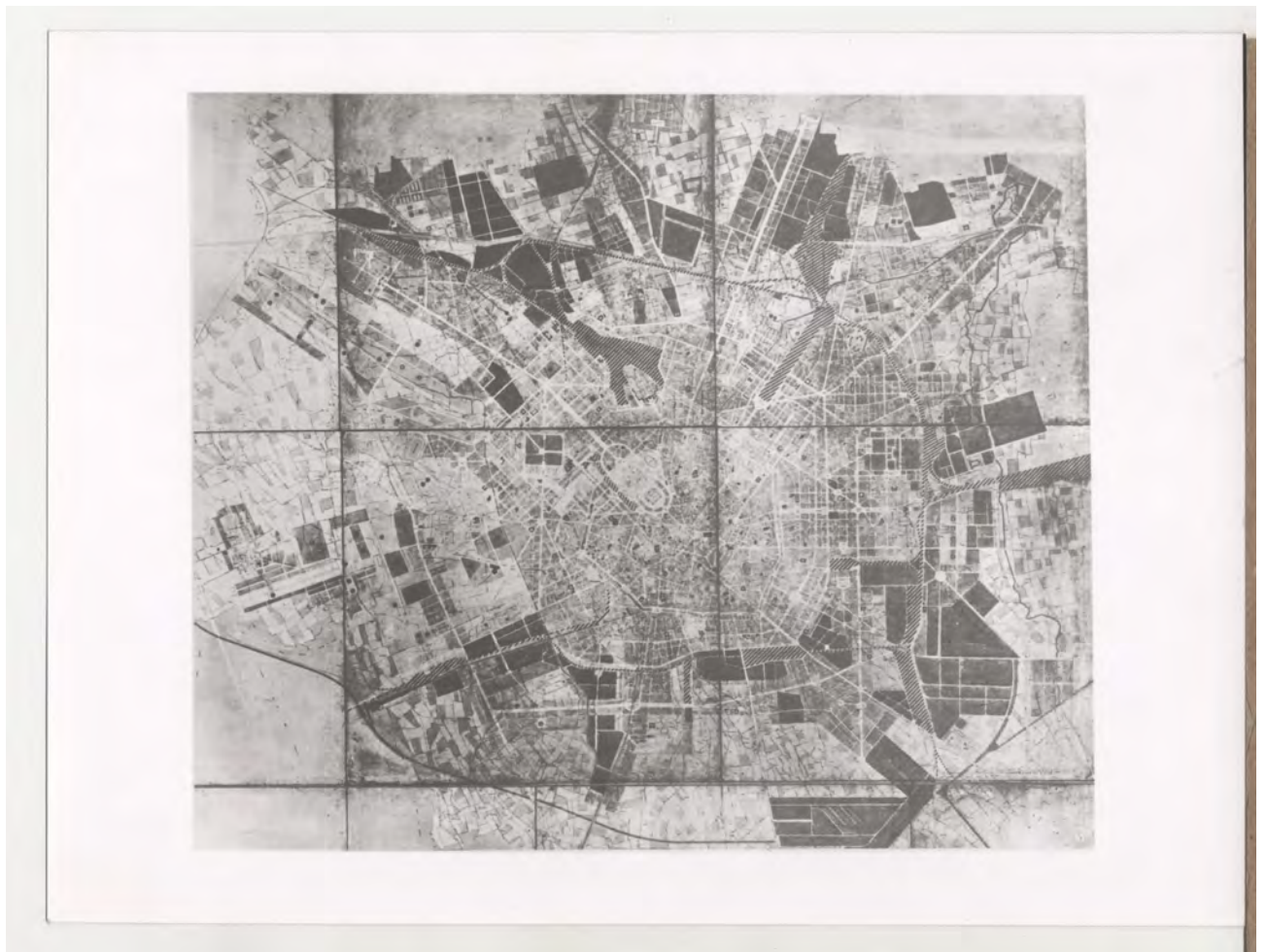
Figure 9. PRG of Milan, area outside the ring road, project of the urban planning division, 1944-45. Luigi Lorenzo Secchi Archives Fund. Unit: Section A, 18, File 2, Historical Archives and Museum Activities Service, Politecnico di Milano, ACL