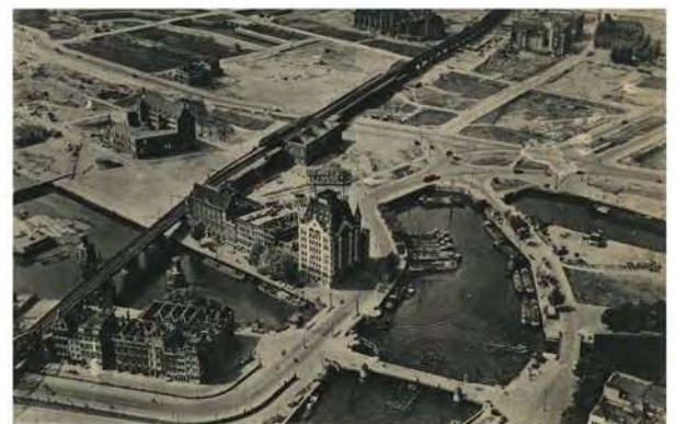
Figure 7a. Rotterdam, Oude Haven before bombardment, 1933. Collection City Archives of Rotterdam, collection 4232, specific number 1970-483, 1933 Figure 7b. Rotterdam, Oude Haven after bombardment, 1946. Collection City Archives of Rotterdam, collection 4232, specific number III-257-19a, 1946