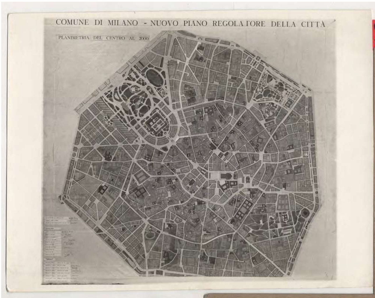
Figure 10. "New city plan, planimetry of the centre as at 2000". The 1948 town plan: planimetry of the centre, within the circle of the bastions. Luigi Lorenzo Secchi Archive Fund. Unit: Section A, 18, File 2, Historical Archives and Museum Activities Service, Politecnico di Milano, ACL