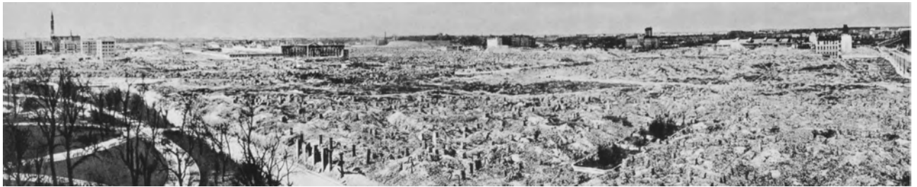
Figure 4. The full destruction of the Warsaw Ghetto, as a reaction of Hitler to the Warsaw Ghetto Uprising in 1943. North-west view, left - the Krasinski's Garden and Swietojska street, photo taken in circa 1950.

K'3vwq'r[r] r(3) s'3vr'a n9wn ( wvln3w( '231n3rt8'p) ( 2w3rq) s'3vr's) 1] 4[n3w( ) s'n( r( 3wr[8( r6 / [n( 's) 1'3vr'pvg8Ca n9v8) 6 ( / [n( ( r1'P1wq1vw'cno23'n( q'vw 3rn] 'sa) ] j 419041t'p) ( 2vq1r1q'3vr'3no4[n'n2n2'3vr'4[3w n3r'on2w's) 1'3vr 1rB) 4( qn3w( ' ) s'j m2n6 Agvr'( r6 'Rr1] n( 'Mg8 "Warschau – die neue Deutsche Stadt" Gvr' / [n( 2'r( 5vntraq'n'pvg8'3vn3'6 n2) ( [8' % ' ) s'3vr'r7w3wt j m2n6 Ggvw'( r6 'Rr1] n( 'pvg8'6) 4[q'or'wvnovg'q'o8' A 'Rr1] n( wvnovg'n( 32'n( q' A 'r( 2[n5rq'c) [vw' / r) / [rAr / [npwt'3vr' / 1r5w42 /) / 4[n3w( ' ) s' A A 'i m2) 5w( 2C K2'n1r24[3Aj m2n6 'snprq') ( r' ) s'3vr' ] ) 23'r73r( 2vgr'n( q'3) 3n[wvt qr2314p3w( 2'q41wt'3vr'frp) ( q'j ) 1[q'j mCK'pn/ wgn[3vn3'3) ] z'2r5r( 'v4( q1rq 8rm2'3) 't1) 6 '6 n2'3n( 2s) 1] rq'w3' n' n3r1w[ 'n( q'2) pwl' qrnq'pvg8 'w' n'2v) 13