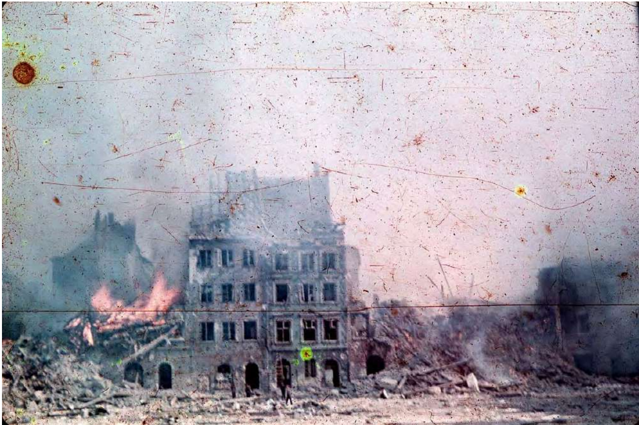
Figure 5. Rare Agfacolor photo (invention from 1936) dated August 1944 taken in Warsaw, Poland in the Old Town Market Place (Zakrzewski's Side) during the fight of Poles against the German Nazis called the Warsaw Uprising. Author Ewa Faryaszewska. Public domain, in Wikimedia (accessed on January 20, 2024)

3w r CZ) 1r'3vn(' A 'i m2) 5wa( 2'6 r1r' ] 41qr1rq'q41wt'3vr'on33[r nt nW 23'3vr'a n9wW 5n2w( 'w' CI( '3) 3n[A A 'pwwr( 2) sj m2n6 'qwq q41wt'3vr'6 m Ca r73'3) '3vr2r'/ r12) ( n'l) 22r2A3vr'o4w3r( 5w) ( ] r( 3'6 n2'n[2) 231) ( t[8'nssrp3rqCLr36 rr(' 'n( q' ' ) s'3vr'r( 3wr'pww8'6 n2'qr231) 8rq Gvr c) [wv' ] ) ( 4) r( 32'6 r1r'n' ] ) 23'n[[qr231) 8rqD 'vw3) 1w'04wqwt2) s'3vr r7w3wt' '6 r1r'qr ] [wvrrqCS) 6 r5r1A3vr'r5r18qn8'41on( 'sno1w) sj m2n6 6 n2'n[2) 231) ( t[8'nssrp3rqCI( ' Aj m2n6 'p) 4( 3rq' A 'q6 r[[wt2CI A( [8' A '6 r1r'23w'w vnoWno[r C Ks3r1'3vr'frp) ( qj ) 1[qj mAj m2n6 '6 n2' ) ] ) 1r'3vn( 'n'sw[q) s'1400[rC g6 r( 38] w'w( 'p40w) r3r12) s'1400[r'n( q'14w'2'6 r1r'n' ] n22rq'w'3vr q) 6( 3) 6( 'nirn Cbs'3vr'3) 3n'l) s' A ] w'w( 'p40w'srr3) s'04wqwt2'3vn3 j m2n6 'p) ( 2w3rq) s'ors) 1r'3vr'6 mA3vr'a n9w'qr ] [wvrrq( ) 'r22'3vn( ' A ] w'w( CI( ' Aj m2n6 '6 n2'p) ( si) ( 3rq'6 w'n'3) 3n'l'n' ) 4( 3) s'1400[r' ) s' ] w'w( 'p40w'srr3"swC " C