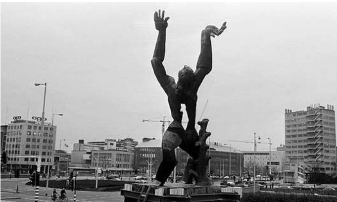
Figure 8. Rotterdam, Monument "Verwoeste stad" by Ossip Zadkine in new location.

[ K] w[23'3vr] r] ) 1w[2'r1rp3rq'3] '3v) 2r'6 v) 'sr[[w'3vr'6 m'Agv'w] ) ( 4) r( 3 6 w[1w'r'n( q'pn[[42'3] '6) 1zCLrs) 1r'42[w'2'3vr] n'w'3n2z) s'o4w'q'w't'n( r6 p38CO) / [ 8r12'n( q'6) 1zr12] 423'w'w'3) tr3vr1'n( q' / r12r5r1rCgvr'8] 423 6) 1z'n( q'p1rn3r'6) 1zCZ n8'3v'w] r] ) 1w[41tr'3vr] ) ( 'n( q'w'2/ w'r'3vr] C