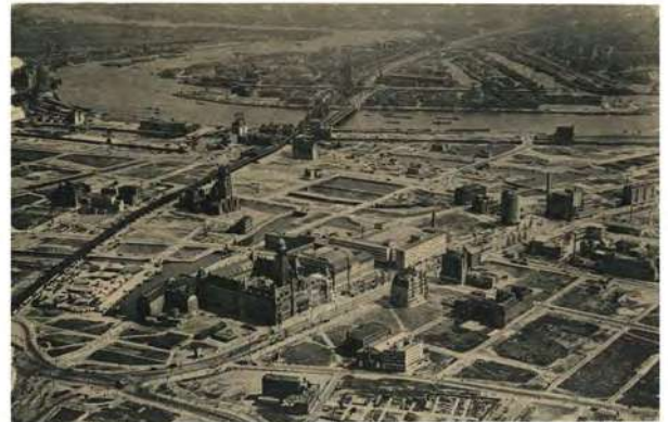
Figure 6a. Rotterdam, Coolsingel before bombardment, 1933. Collection City Archives of Rotterdam, collection 4232, specific number III-168-03-9, 1933 Figure 6b. Rotterdam, Coolsingel after bombardment, 1946, specific. Collection City Archives of Rotterdam, collection 4232, specific number III-254-2-1, 1946