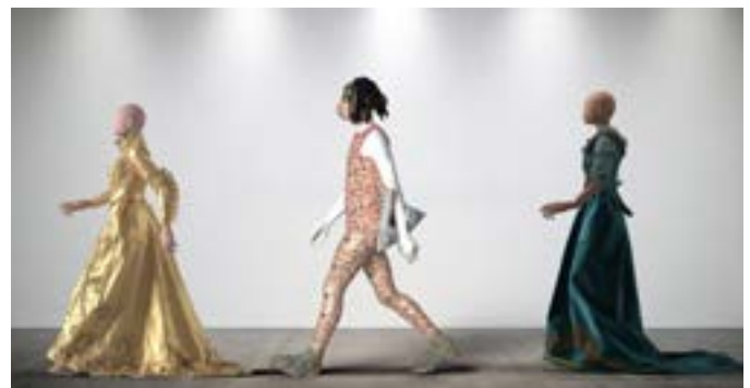
Figure 3. Digital Twins simulated for the “From Pattern to Polygon” exhibition.

A best practice in this field was the exhibition From Pattern to Polygon ( https://www.centraalmuseum.nl/en/exhibitions/utrecht-lokaal-from-form-to-polygon ) at Utrecht Centraal Museum – coordinated by Studio PMS and several young Belgian designers – that uses RE to stage the kinetic dimension of digital archival fashion through virtual catwalks while study and reinterpreting the object itself (Figure 3).