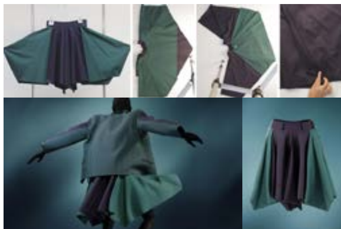
Figure 2. The Virtual Fashion Archive acquisition and simulation phase. Source: Virtual Fashion Archive https://virtualfashionarchive.com

The acquisition phase starts with the artefact and its related documentation and implies the access and deepening of the technical documentation available within the archive to start digital explorations to trigger the complete understanding of the artefact’s creative processes. Patternmaking and archivist/historical competencies, as well as fashion design and curatorial ones, are involved in the RE acquisition phase, providing culture-intensive insight and appropriating the intrinsic value and techniques inherent in the object. The study of sketches, technical drawings and related paper patterns are verified and validated by directly acquiring dimensions and specifications from the object itself. The digitisation process is crucial at this stage to inform the next steps. Paper patterns are designed from scratch, acquired manually or through automatic digitisers in order to be translated from physical to digital shapes. Shapes of the artefact are captured involving photogrammetry and 360° product photography, which leads to the creation of a wireframe, providing a com-