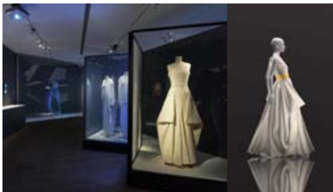
Figure 4. Highlights from physical and digital restitution formats of the "Exploding Fashion" exhibition.

Following what Muzzarelli et al. (2010, p.10) state: "A dress is not just a dress but the intersection of a series of trajectories,