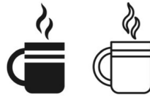
Fig. 1 Illustration of Wheeler's original TE. In this experiment, it is imagined that two cups of tea are dropped into a black hole