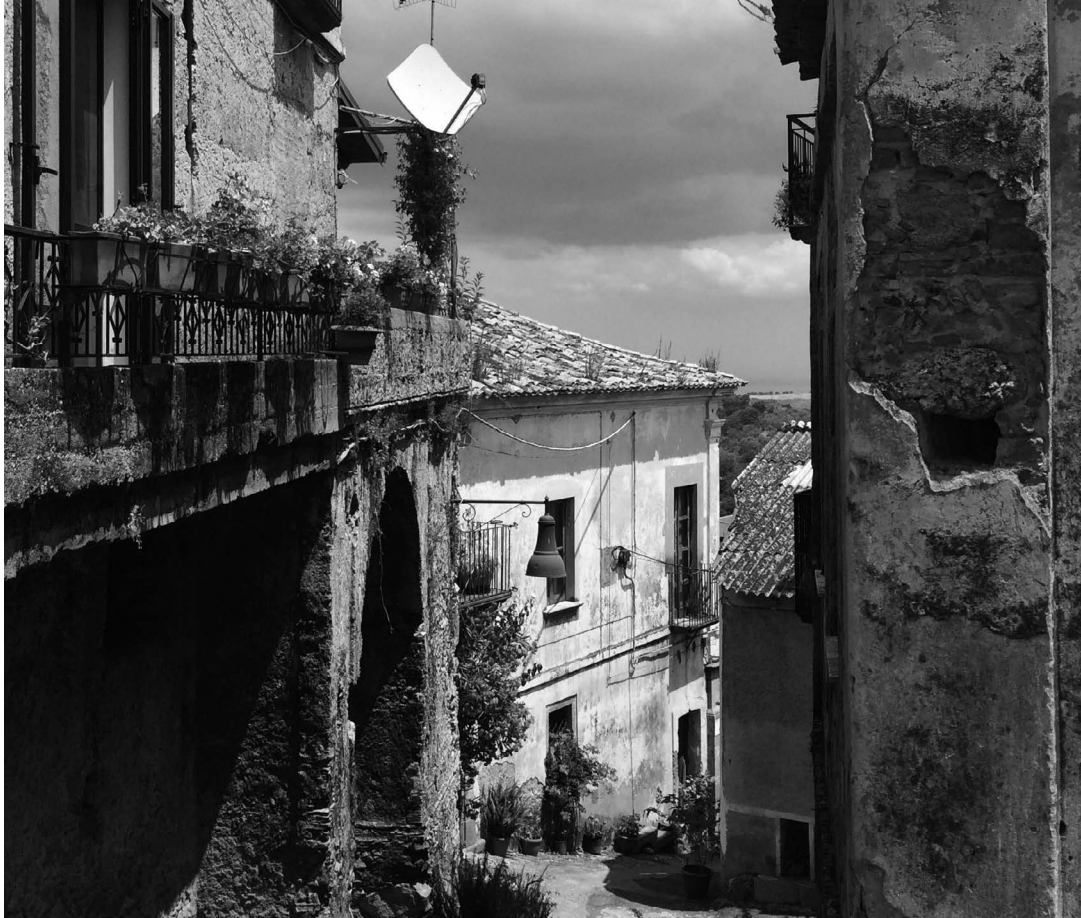
FIGURE II.2.5 Gagliato: semi-abandoned historic town centre.