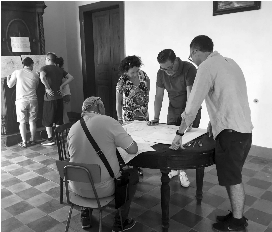
FIGURE II.2.3 The participatory design workshop: Local people discussing the future of Gagliato.

the impact obtained on the ground. In the policy recommendations document produced after the workshop, the following points were raised: