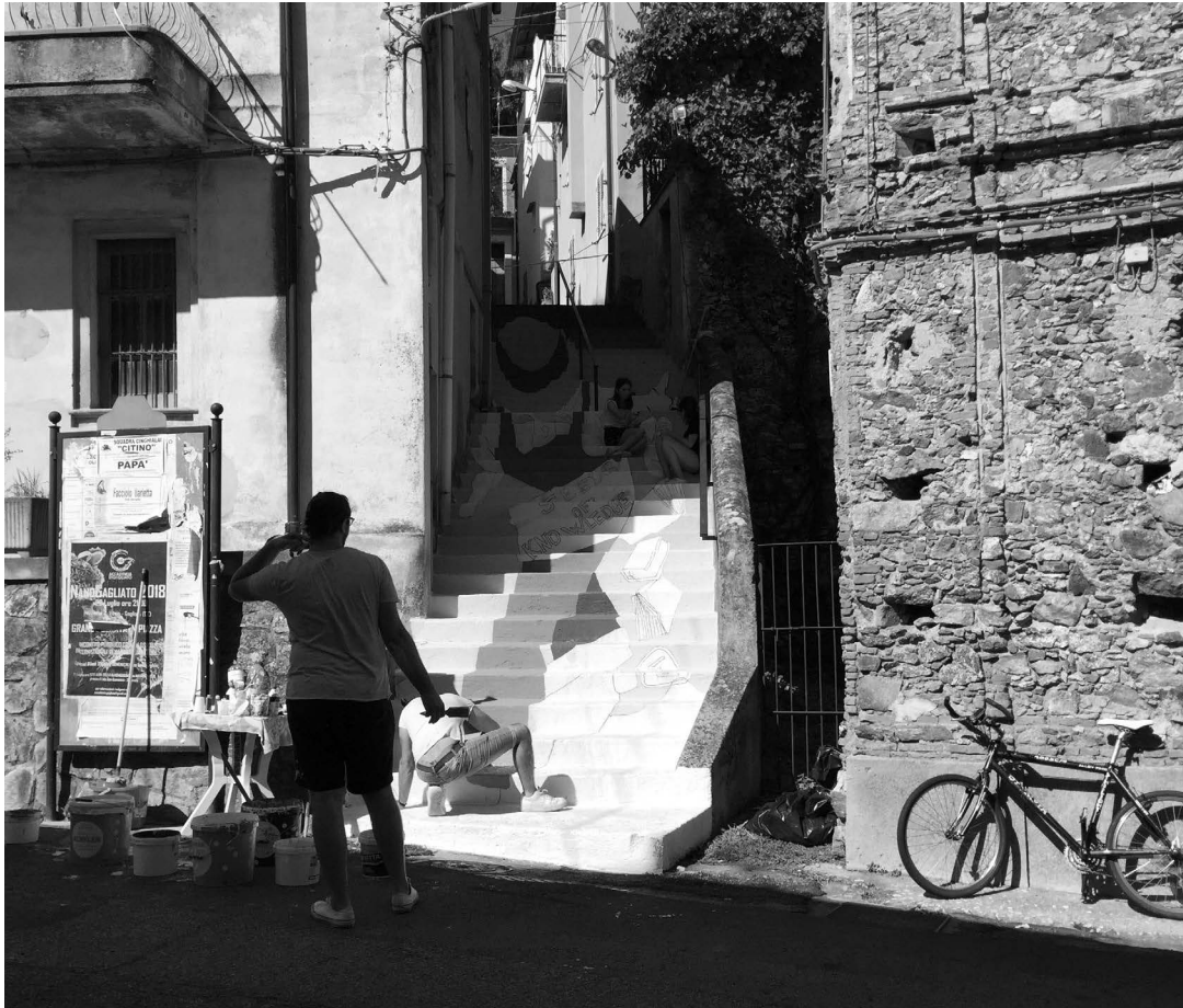
FIGURE II.2.4 The painting of one staircase of Gagliato during NanoGagliato 2018.

in meetings), and the preparatory work was constantly shared during town hall committee meetings open to the community. This is a case of “empowered participatory governance,” which relies on the commitment and capacities of ordinary people and ties action to discussion (Fung & Wright, 2003), and it is ultimately an example of the specific design of institutions, which can or could deliver transformative democratic strategies (Watson, 2013).