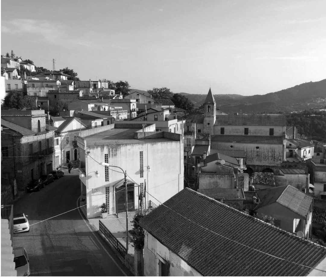
FIGURE II.2.2 A view of Gagliato with the church of Saint Nicola Vescovo.

has materialised in the so-called “ Serata in Piazza ” (evening in the piazza), the concluding public event of the summer gathering, which has become an important appointment for the people of Gagliato and beyond. Moreover, a fundamental component of the Academy of Gagliato is the so-called “ Nanopiccola ,” which aims to involve the children of Gagliato in various activities related to science, technology, engineering and mathematics learning, both during the summer event and over the year. It is an initiative that has helped to engage various local families in the life of the academy.