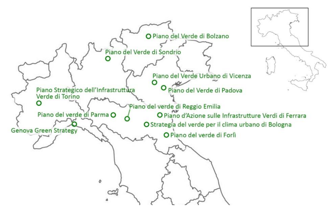
Fig.1 Localization of the green plans and strategies in Northern Italy

From the operational point of view, the survey has screened the official websites of the local governments to access and download the Green Plan documents.