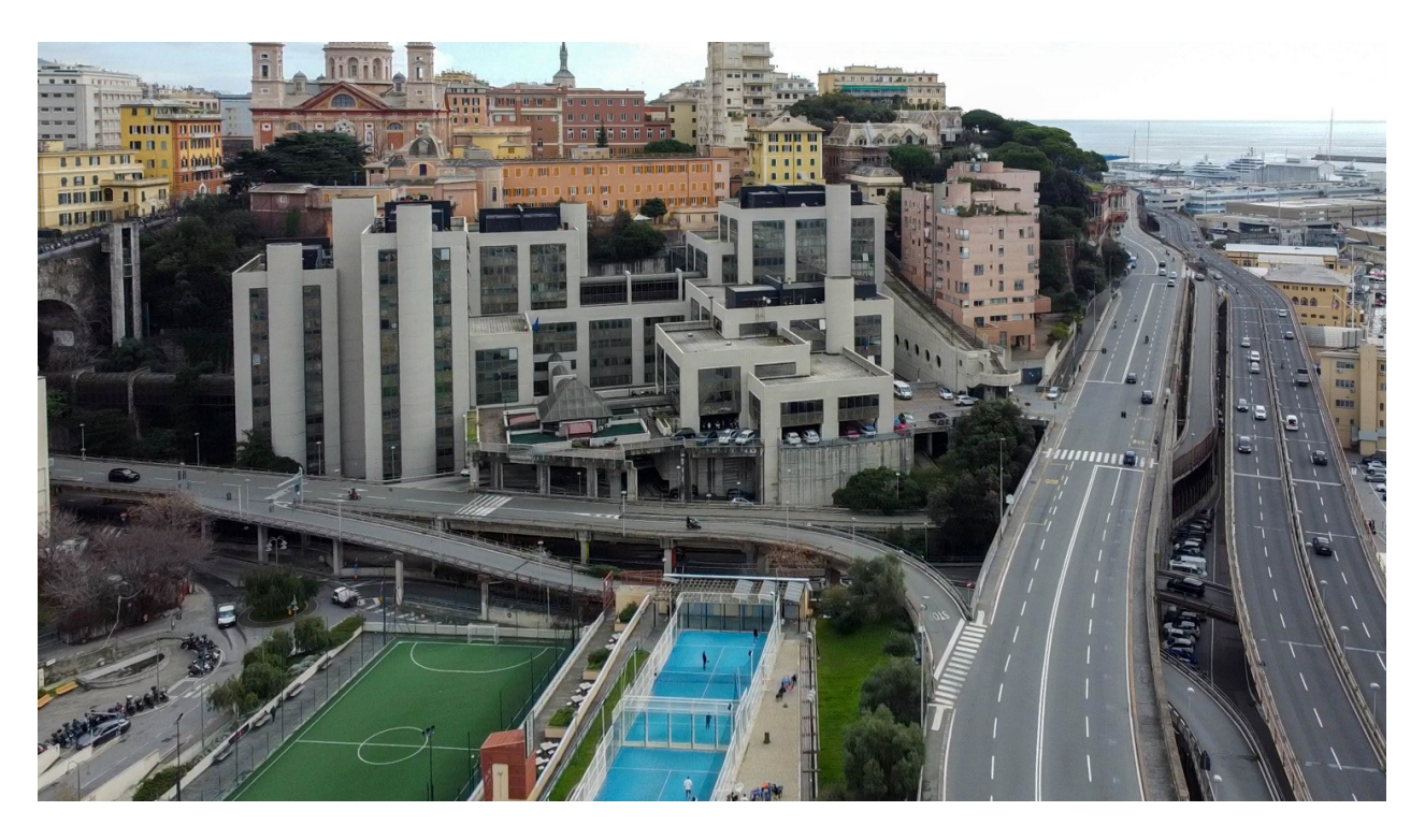
Figure 2. Carignano district and its relationship with the sea, 2023.

In more recent times, the concept of "smart shrinkage" has surfaced in the North American context (Beauregard, 2003; Ryan, 2012). This is a strategy that has emerged mainly in the spatial planning debate and is developed according to an approach that attempts to address and guide the ongoing phenomenon of shrinkage through planning that is more attentive to environmental and participatory issues. The objective of smart shrinkage is to offer an alternative planning model, no longer focused solely on growth and development, but able to accommodate shrinkage processes by downsizing the inhabited areas and ensuring a good quality of life for its inhabitants even under conditions of progressive shrinkage (Hollander, 2020). This objective is generally achieved through introducing building regulations that discourage new constructions in areas with high vacancy rates, encouraging the demolition of abandoned buildings, introducing relocation assistance for residents living in areas with high vacancy rates, implementing new zoning in shrinking areas to allow for new uses (Hollander & Nemeth, 2011), and encouraging land banking practices, i.e., aggregating land parcels that are generally fragmented into larger parcels, which are usually considered more attractive for potential transfer of ownership and development.