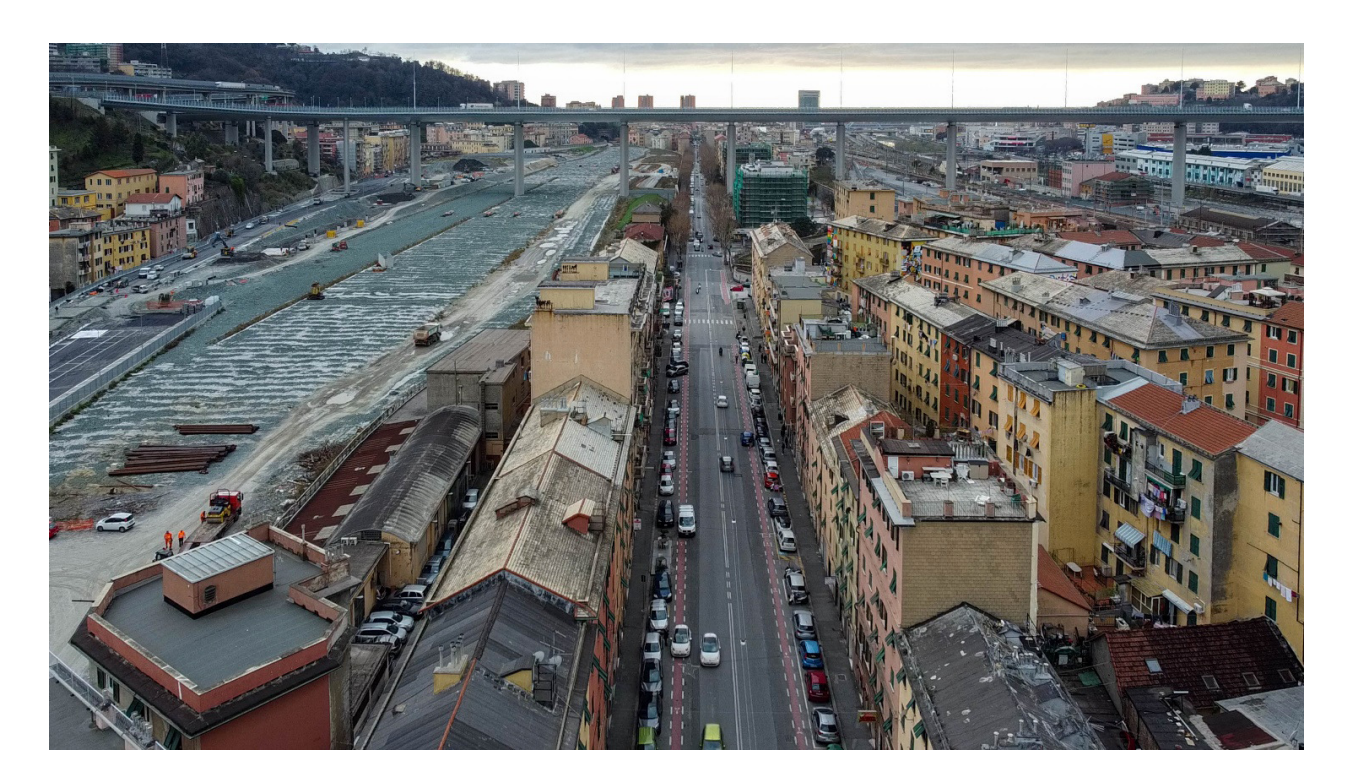
Figure 7. The new San Gregorio Bridge and the Sampierdarena and Certosa districts, 2023.