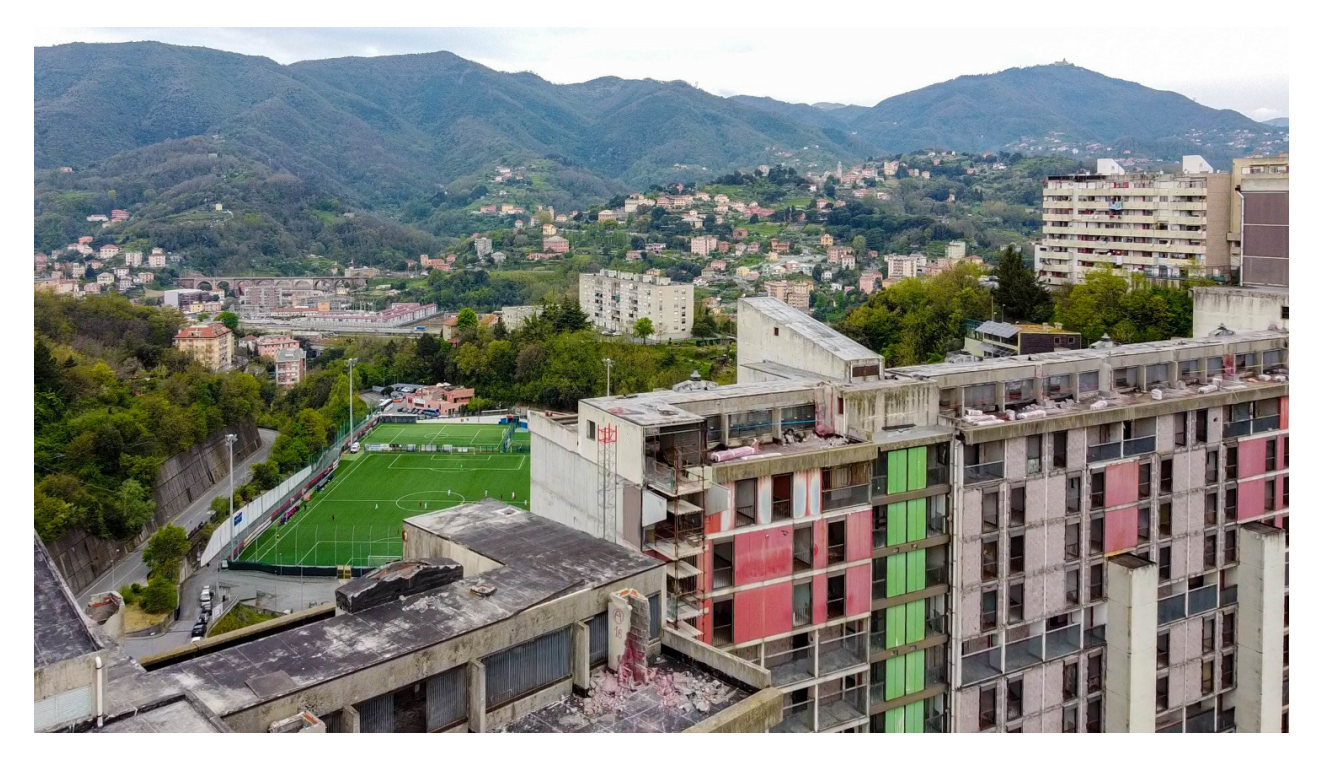
Figure 4. Diamante district, Valpolcevera, and Begato Dam during dismantling and demolition, 2021.