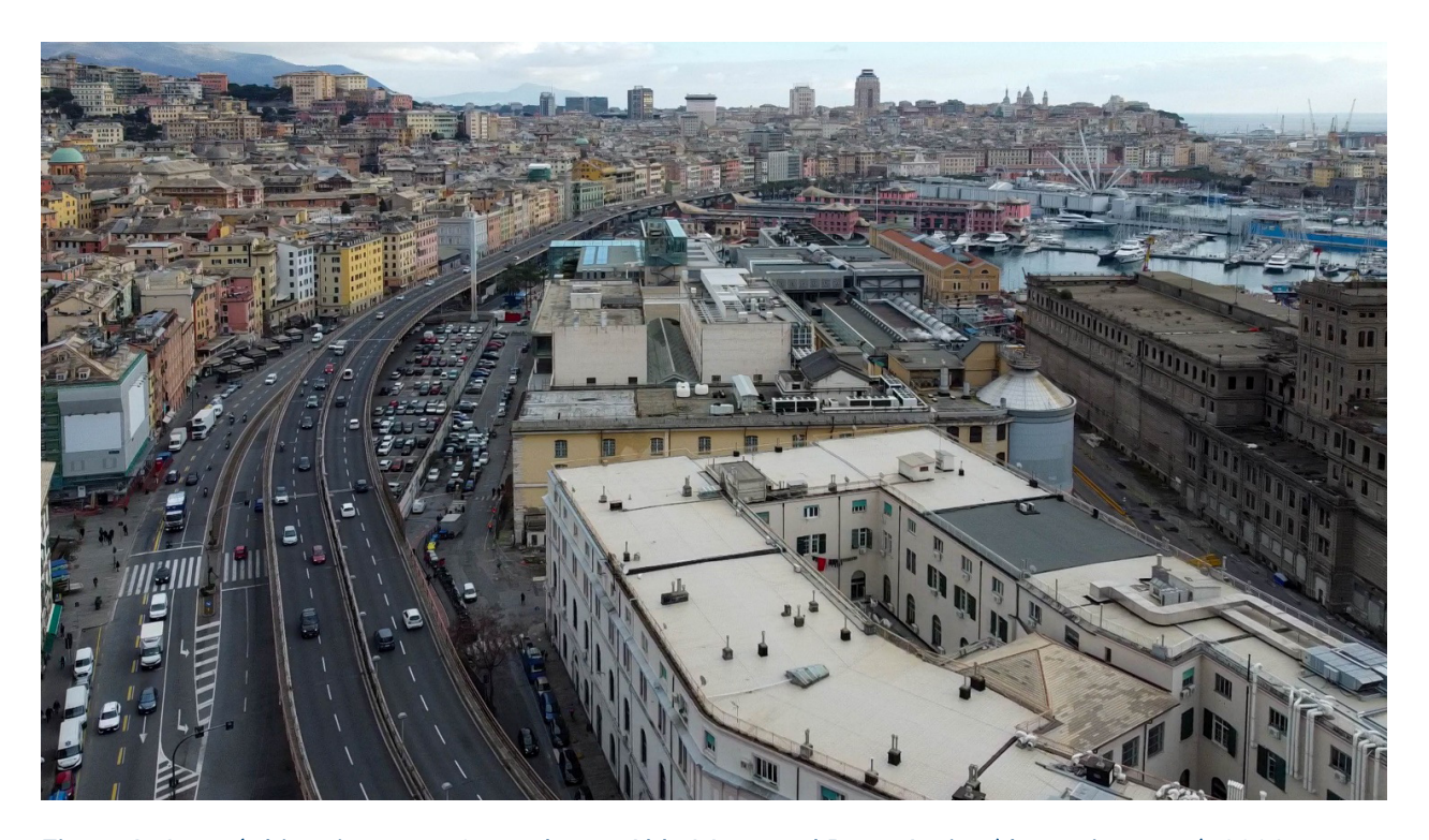
Figure 1. Genoa's historic centre, Sopraelevata Aldo Moro, and Porto Antico (the ancient port), 2023.

This article will give a critical reading of specific situations influenced by urban shrinkage and will be organised into seven parts. Following the first introductory part that traces the research question and research methodology, the second part of the article will explore the concept of urban shrinkage and examine how spatial projects have the potential to challenge conventional models of growth. The third part will delve into the trajectory of the City of Genoa as a shrinking city, relating it to both national and international contexts. The fourth, fifth, and sixth parts of the article will observe the processes and spaces generated by the controlled shrinking projects of the Begato Dam, the Morandi Bridge and the Levanto Waterfront. These three parts will investigate the principles, forms, and expectations of the controlled shrinking projects. Finally, the seventh and final part of the article will offer some concluding reflections on the relationship between spatial design culture and the process of urban shrinkage, and potential directions for future research and actions related to the subject.