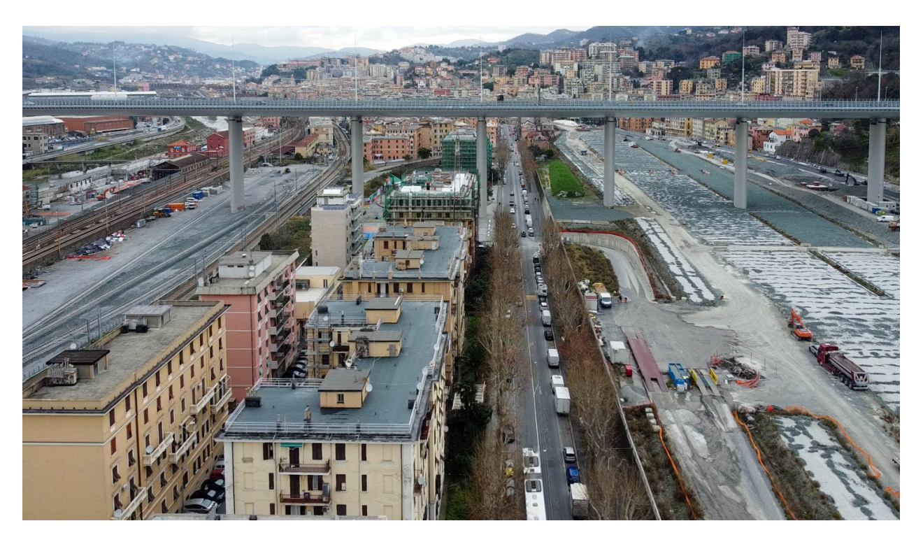
Figure 6. The new San Gregorio Bridge and the Sampierdarena and Certosa districts, 2023.