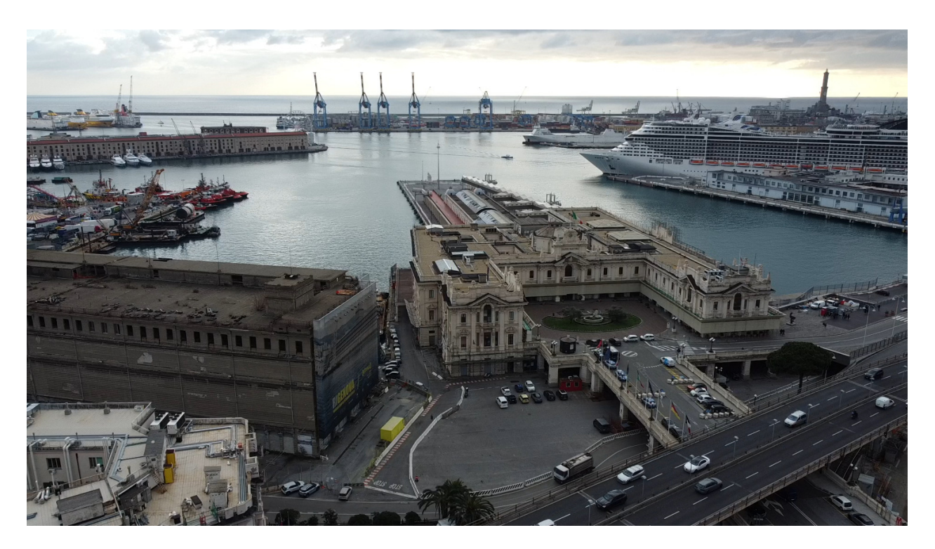
Figure 10. Hennebique Silos and the stazione marittima (maritime station), 2023.

The three controlled shrinking experiences offer an opportunity to revive important research perspectives in urban studies, which, after a successful research period in the 1990s and 2000s, had been somewhat neglected in recent years. Despite their contradictions, the added value of these project experiences lies in the problems and ambiguous questions they raise. Emphasising the social aspects of controlled shrinking projects can be a useful tool for exploration and taking action. These projects demonstrate the existence of economic and social relationships grounded in principles beyond market dynamics, exchange, growth, and consumption. This awareness compels us to take into consideration less explored directions in research and design which engage in widespread reciprocal interactions that go beyond mere technical dimension, quantities, and emergent timing of final results.