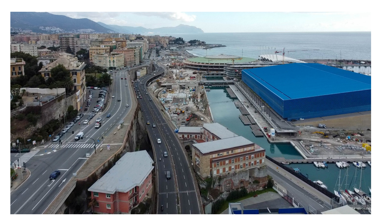
Figure 8. Levanto Waterfront, Carignano and Foce quarters, and the work in progress at the Fiera del Mare, 2023.