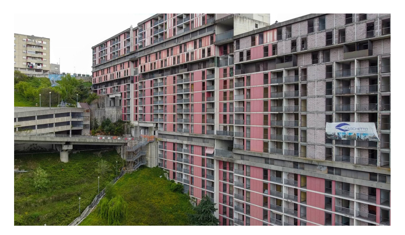
Figure 5. The facades of the red and white Begato Dam during dismantling and demolition, 2021.