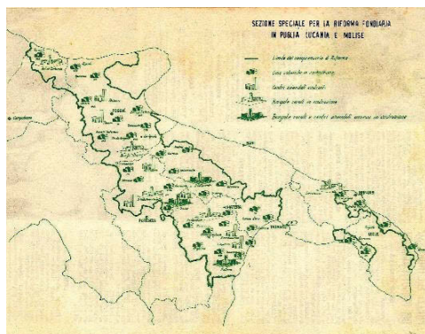
Fig. 1. Map showing the distribution of the rural villages of the Agrarian Reform in Puglia, Basilicata and Molise

and the allocation of farms, followed by the execution of large-scale land reclamation and irrigation works, as well as the establishment of a transport infrastructure network and, as a final stage, the construction of villages and farmhouses. As such, as a result of the Agrarian Reform in Basilicata, numerous rural settlements sprang up in the provinces of Matera and Potenza. Some of the most significant ones in the Matera area include: Borgo Taccone and S. Maria d'Irsi in Irsina, Macchia in Ferrandina, Calle in Tricarico, La Martella in Matera, Caprarico in Tursi, Scanzano in Scanzano Jonico, Serramarina and Metaponto in Bernalda, Pianelle in Montescaglioso, Gannano in Stigliano and Policoro in the town of the same name. The Potenza area, meanwhile, saw the establishment of: Masi and Piano del Conte in Avigliano, San Cataldo and Sant'Antonio Casalini in Bella, Gaudiano in Lavello, Boreano in Venosa and Leonessa in Melfi (Abate & Argento, 2015; Filadelfia, 2004; Percoco, 2010).