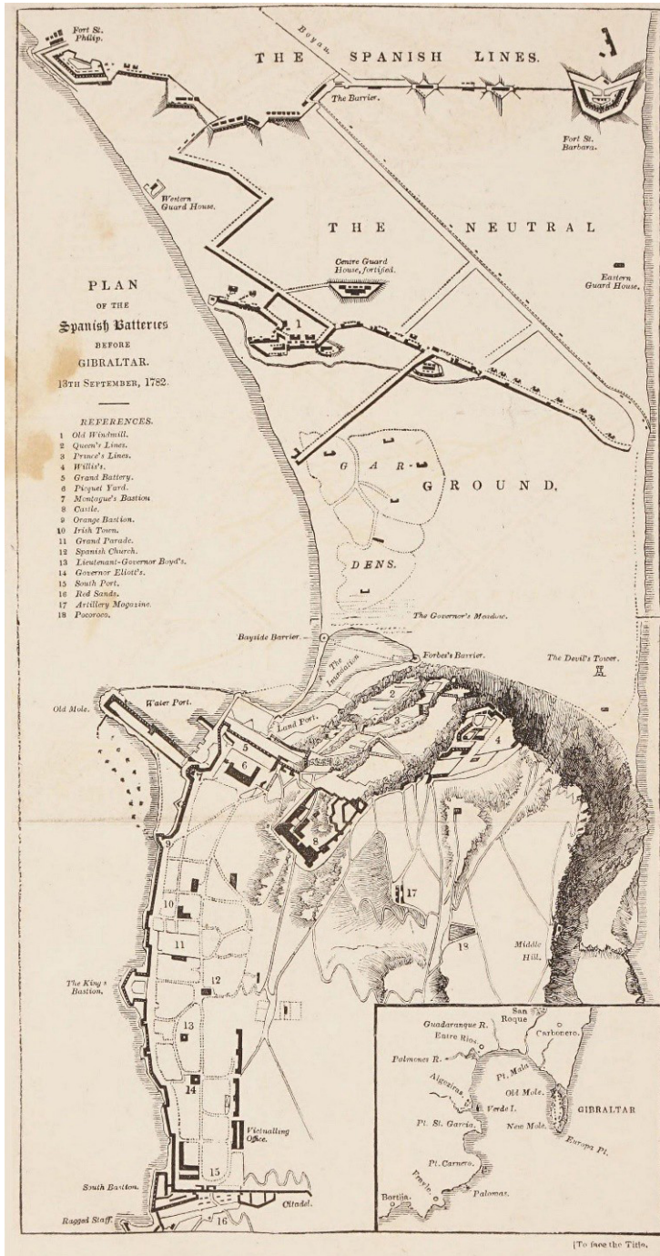
Fig. 1. Map of the Contravallation Line and Gibraltar's northern defences in 1782.