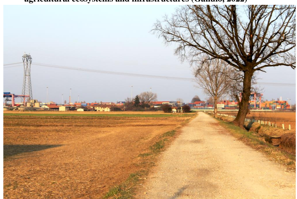
Fig. 4 Quality of metropolitan urban-rural interface spaces between agricultural ecosystems and infrastructures (Galiulo, 2022)

Comparing Metropolitan Cartography to other territorial analysis methodologies, like traditional maps of socio-economic statistical applications, it emerges that this method can create the roles necessary to organize the procedure pertaining to competency training (Contin et al., 2023). Through this procedure, the urban frames are oriented for decisions that are based on each system agent's cultural code (the values that guide the choices). By doing this, it is feasible to prevent pressure from conventions, routines, and individual traits when making decisions. Though it has a significant potential, the issues that emerged through its application are related mostly to the problem of collecting enough data to prepare explicatory protocol maps and to keep the consistency through the different scales in terms of reliability and update of the information represented.