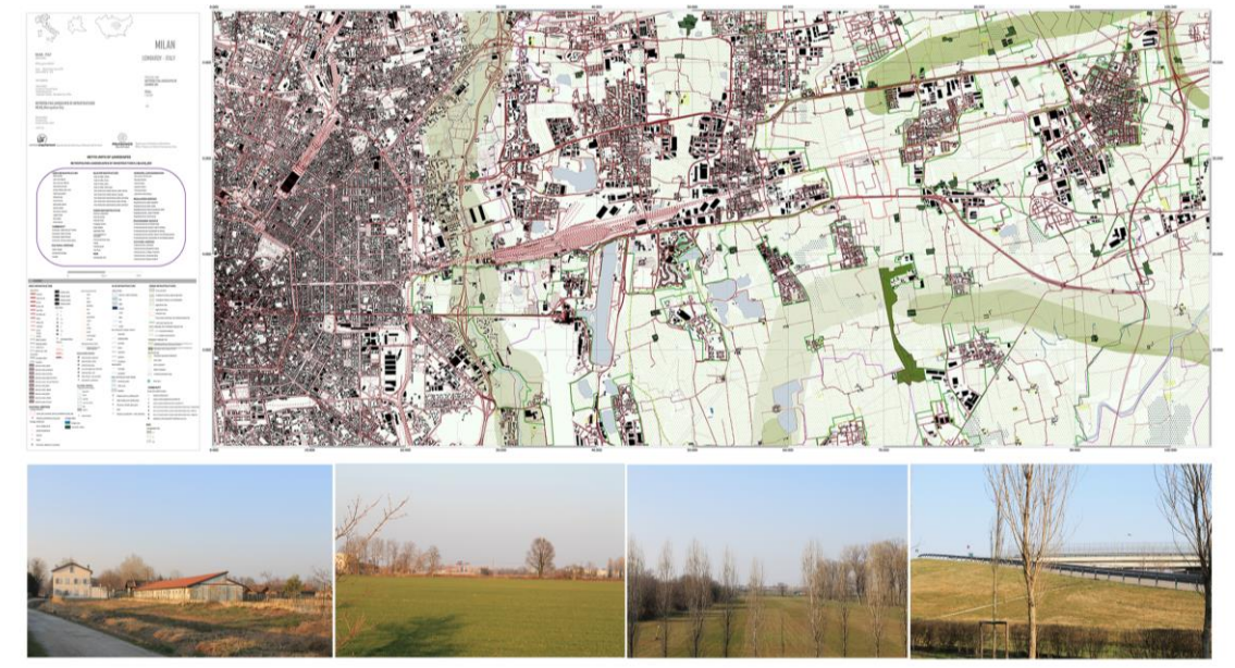
Figure 3 - Metropolitan Landscapes of Exchanges Protocol Map (Galiulo, 2022)