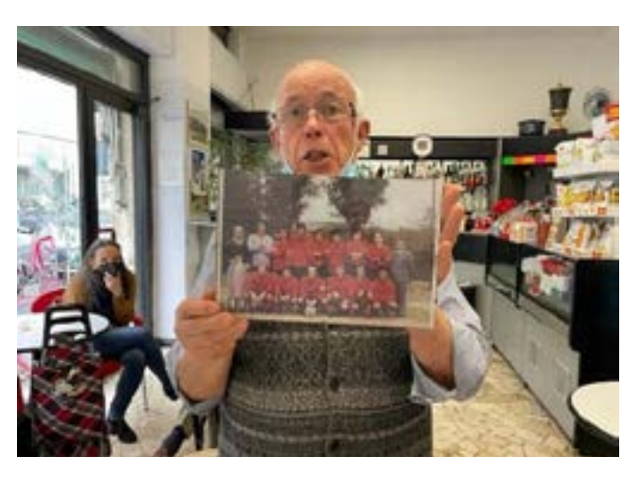
Figure 5. One of the participants showing the neighbourhood old soccer team.

of the places identified by the participants, was the historical one. Cards were placed on a timeline, and participants were asked if they felt a sense of belonging from the start or if it changed significantly as time passed (Figure 3).