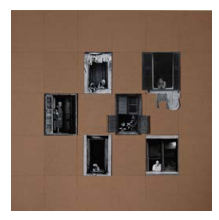
Figure 6. Condominiums initiatives.