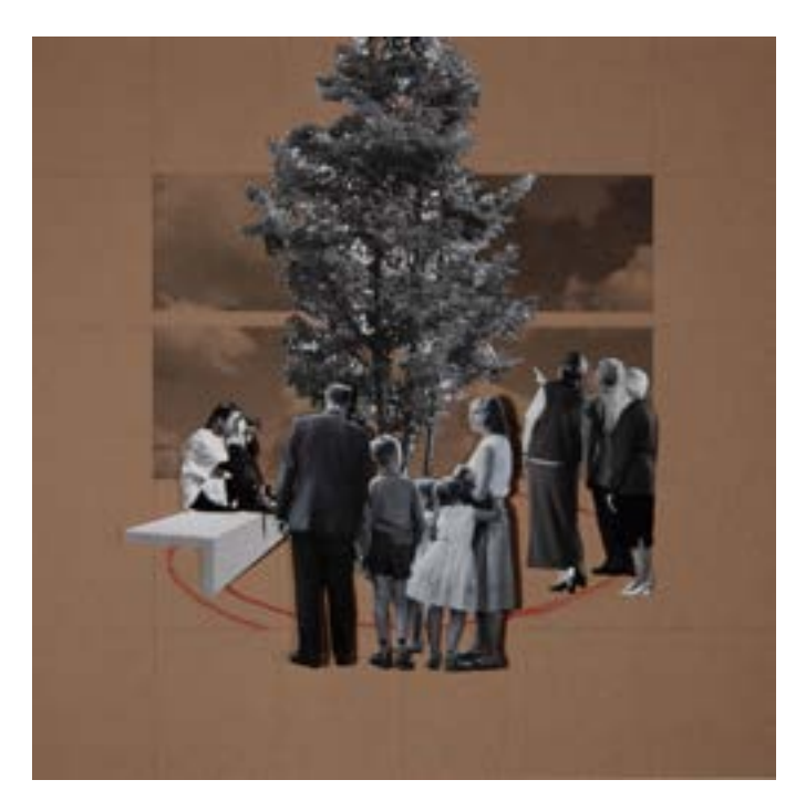
Figure 8. Neighbourhood heroes.