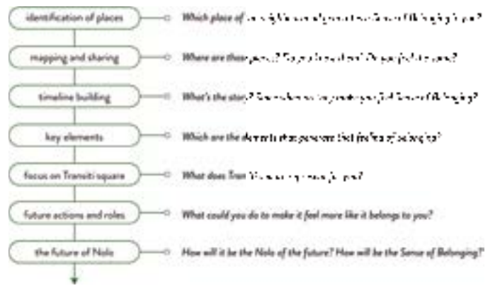
Figure 1. Workshop's phases (Diagram by the authors).