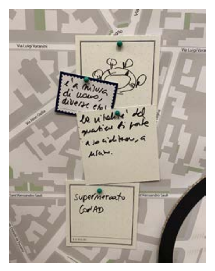
Figure 2. Interactive mapping.