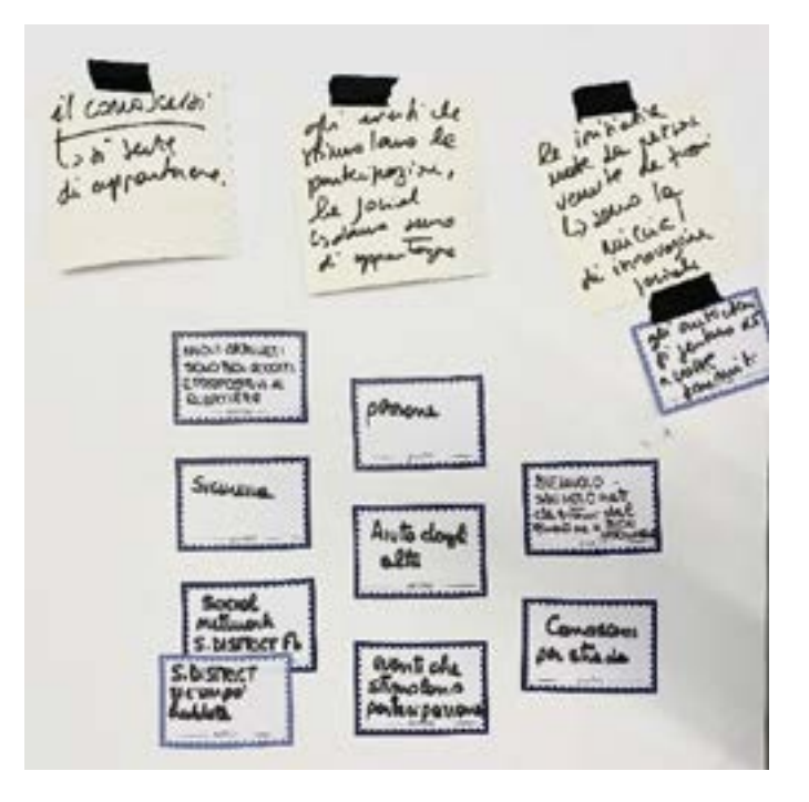
Figure 4. Activity to delineate the qualities and doubts about the neighbourhood.