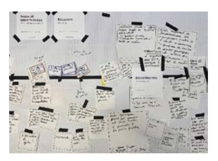
Figure 3. Interactive timeline.