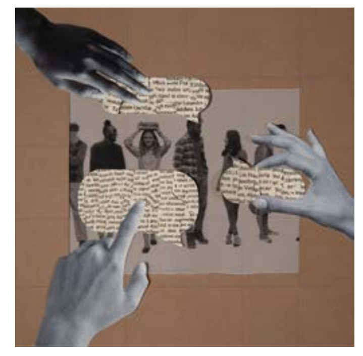
Figure 9. Neighbourhood "Agorà".