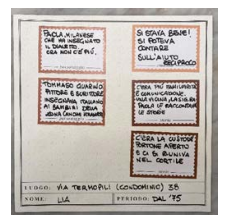
Figure 6. Activity to delineate the key elements of the places that generate a sense of belonging.

ty (Figure 6). The activity ended with a collective reflection about the future of the neighbourhood, taking into consideration all the aspects that emerged during the session.