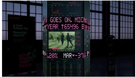
Figure 2. Micromort stock exchange monolith (2020).

The experimental projects that are going to be presented aim to “unsettle the present rather than predict the future” (Clark, 2011) and to use design in an active way (Dunne & Raby, 2013). As Peace (2019) asserts “a work of speculative design is often an object [...]. While prototyping deals with how an idea could be realized, speculative design asks what if that idea was prevalent in our society? Would we want it?”.