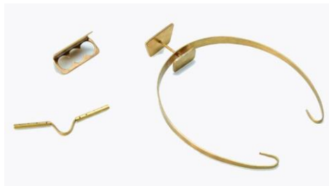
Figure 4 – The Kaluma jewels (2020).

others' bad luck or death. A fictional test (named Schadenfreudemertest ) forces the users to simultaneously watch six videos of real-life events, including deaths and killings. The machine is equipped with an Eye Tracker that follows the movements of the user's gaze, analysing how long people focus on each video. Another essential part is the headrest, equipped with two blinkers with integrated speakers that play the audio and also constrain the users' movements while watching the videos. At the end of the experiment, the Eye Tracker's collected data are processed by customised software that prints a report. The graph represents the trend of the user's Schadenfreude level. The whole experience aims to reflect on human morbid curiosity about death, which tends to be emphasised by media and social channels, through fiction with several communicative levels: a consistent visual identity inspired by Dieter Rams' design for Braun, which has been developed both in 2 and 3 dimensions; the accurate selection of videos, a strong contemporary medium, showing well-known events; the final data visualisation.