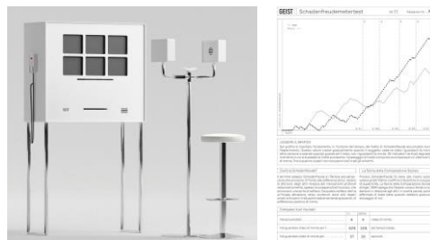
Figure 3. The Schadenfreude test machine and the final output printed (2020).

The first project, named Micromort (Figure 2), is a fictional currency connecting nationality and the value of death. The project intends to emphasise the fact that death always has a different social value depending on where it occurred or who has been involved. The critical and political position behind the project is that this value depends on how the western world perceives itself. The speculation is materialised into a ‘stock exchange monolith’. Thanks to an algorithm (Hades 2.0) that considers the GDP per capita, the population and the number of violent deaths of each state in the period between 2000 and 2017, Micromort calculates the price of every single death worldwide. More than 21.000 real data items have been collected from public databases. The consistency of the Communication Machine design (the monolith), the data visualisation and the user interaction/interface reveal the critical position of the students.