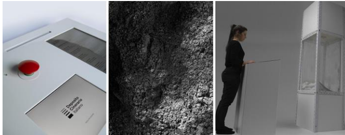
Figure 5. Deposito Cinerario Italiano (2020).

inhumation or cremation. There are no other viable solutions: religions other than Catholicism are excluded. For instance, Muslim communities are often forced to repatriate the bodies of loved ones to the country of origin, although they are registered as Italian citizens. This scenario inspired the critical position for Deposito Cinerario Italiano , where the user is pushed to act as an agent for a collective burial, where all deceased are equals and indistinct.