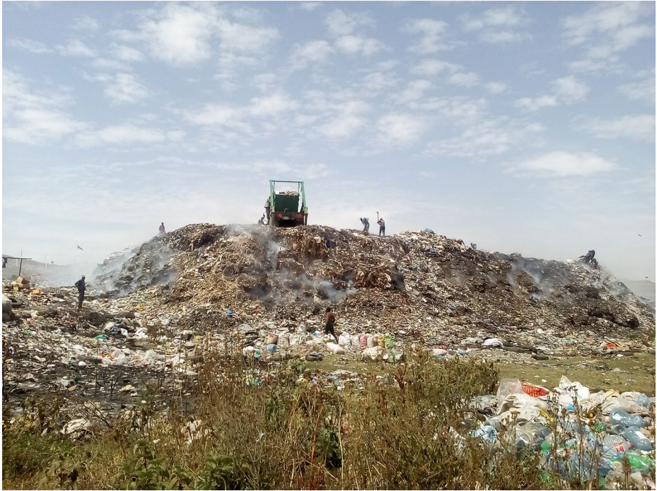
Fig. 2 The dumpsite of Ngong, with a collection truck dumping waste and waste workers in activity (February, 2018)

Working and health conditions of the Nuru people are of course very harsh, with continuous exposure to physical and chemical hazards, due to the presence of rotting waste, of smoke because of fires, etc.