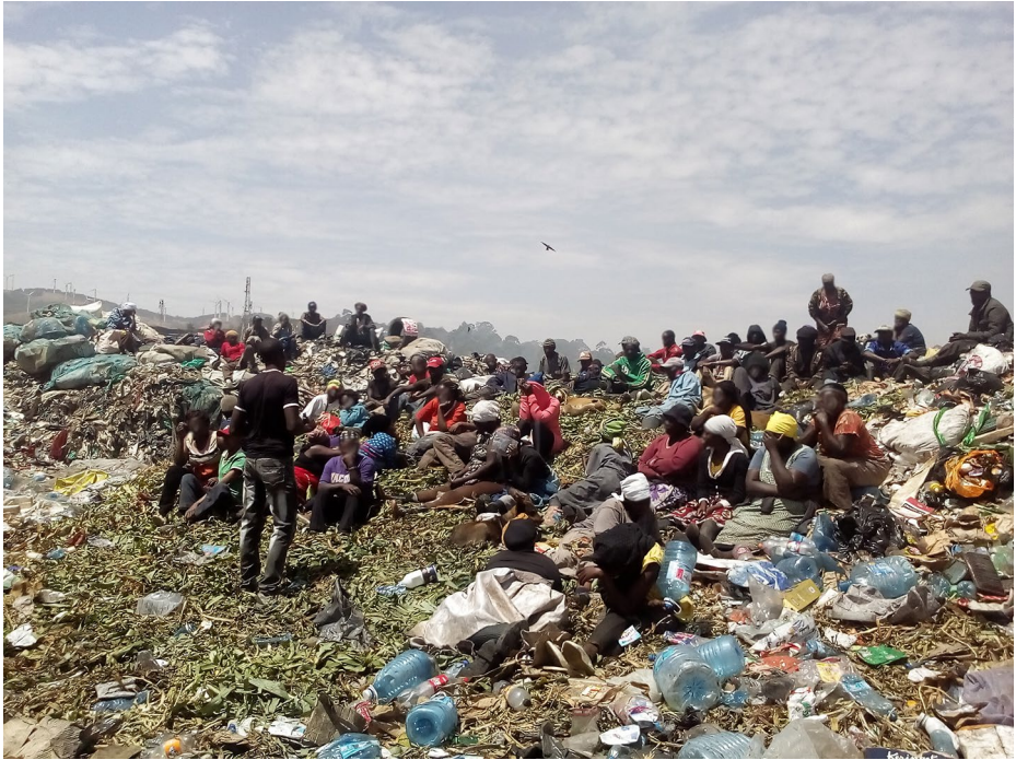
Fig. 3 Meeting of Nuru Assembly at the dumpsite of Ngong (February 2018)