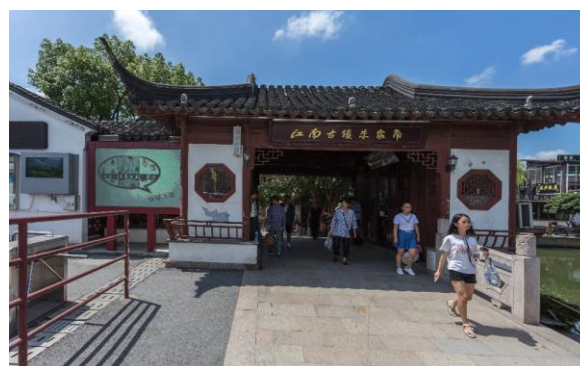
Figure 7. One of the gates of Zhujiajiao where, until 2008, entrance fees were charged to visitors.

Plans followed, among which were the “Zhujiajiao Central Town Strategic Plan (2004)” and the “Zhujiajiao Control Plan (2005),” structuring three areas with different functions. Fostered by a robust advertising campaign, the tourism industry increased rapidly, reaching a peak in 2002, when a million visitors came to Zhujiajiao. Facilities and services proliferated, financed by public funding allocations and private initiatives, and, in 2004, Zhujiajiao was enlisted as a top-level tourism destination 3 . In 2016, it was appointed as one of the “Characteristic Towns in China” [57] , and the number of tourists to Zhujiajiao rocketed from one million in 2002 [57] to more than seven million in 2018 [66] . Entrance gates to facilitate fee payments were introduced [Figure 7], consecrating the historical settlement to a touristic consumption experience. The unexpected pandemic outbreak severely impacted visitors’ fluxes. Although specific data on Zhujiajiao are still unavailable, China’s Statistical Yearbook registered less than half the number of domestic tourists in 2020 compared to 2019, while foreign arrivals were not yet reported [Figure 8] 4 . In 2021, a dedicated website appeared to illustrate all the services