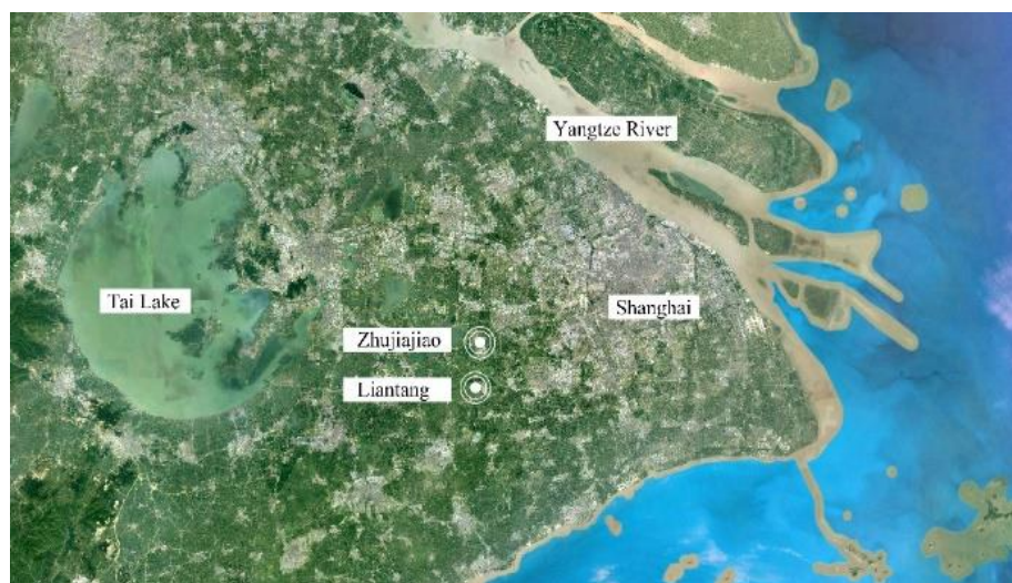
Figure 2. Location of Zhujiajiao and Liantang water towns in relation to Shanghai and to the Yangtze River Delta.

Many water towns in the Lake Tai Basin have already been included in the lists of historic and traditional settlements compiled by the Ministry of Housing and Urban-Rural Development and the State Administration of Cultural Heritage. Over the last decades, their distinctive built environments have been seen as a lucrative ambience for mass tourism consumption, activating a process of heritage commodification [Figure 3]. Their Historic Urban Landscapes' spatial experience [60] underwent a process of fragmentation with the introduction of activities and spaces dedicated to visitors, such as souvenir shops run by a new class of merchants or turnstiles and gates where entrance fees are collected [61] .