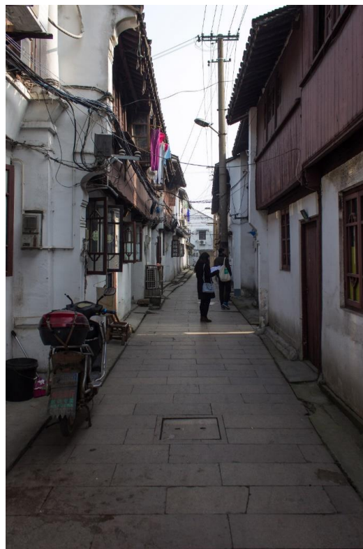
Figure 10. Old market street of Liantang.

In the fringe areas, the urban environment abruptly loses its traditional connotations. Medium-rise condominiums have been erected in repeated arrays, determining a generic urban environment [Figure 14]. Despite these modern presences, the integrity and distinctiveness of both the settlement pattern and the architectural form make Liantang an original historical site, expressing tangible and intangible forms of heritage [67] .