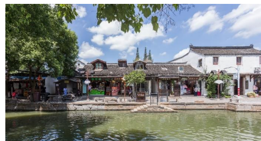
Figure 5. Elevation along the canal of Zhujiajiao. Souvenir shops pullulate along the touristic path, representing an example of heritage commodification. Source: Photo by the author, 2018