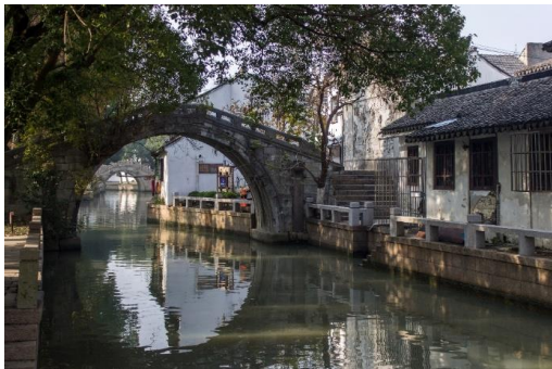
Figure 12. One of the stone bridges featuring the traditional ambience of Liantang.