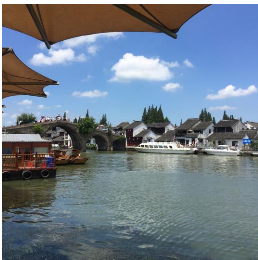
Figure 6. Fangsheng Bridge in Zhujiajiao.

In the past, Zhujiajiao had 36 bridges, but only 20 of them have survived today. The most important one is the Fangsheng Bridge, which was designated as “Liberate Living Things” by Ronald Knapp [62] . The structure, built in 1571, is a 72m long, five-arch stone structure, rising 7.4 m above the Caogang River, and is considered as the largest of this type in southeast China [Figure 6].