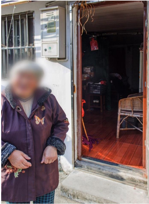
Figure 11. A resident of Liantang reporting about the difficult living conditions and the preoccupation of losing her house after government-led renovation works.