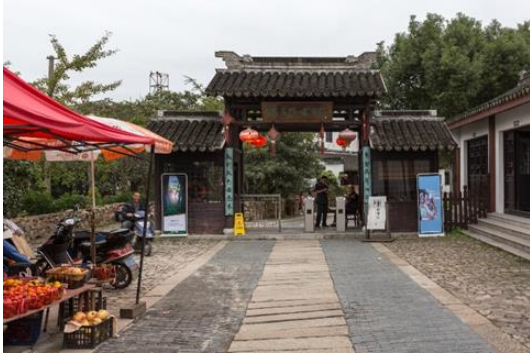
Figure 3. Entrance gate to Mingyuewan Historic Village, located in the south of Xishan Island in Lake Tai. The settlement is designated as a historical and cultural village, and a national agricultural tourism demonstration pilot project.