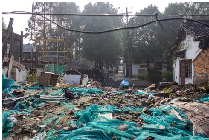
Figure 15. Unexpected demolitions found in Liantang.