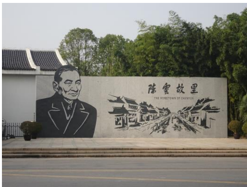
Figure 13. Memorial Hall of Chen Yun in Liantang.

The local government promoted renovation actions in 2016, but, unfortunately, the bulldozers turned down several historic buildings, leaving Liantang in problematic physical and sociocultural conditions: lacunas within the built fabric and people evictions [Figure 15]. This unexpected episode stimulated investigative works to document the historical values of Liantang and to propose strategies for sustainable sociocultural development.