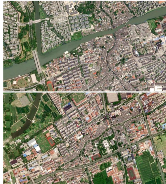
Figure 1. Aerial view of Zhujiajiao (top) and Liantang (bottom) water towns.

This research grafts on this contended domain and investigates how heritage tourism has impacted and could impact two comparable historic sites, Zhujiajiao and Liantang water towns, differing in one substantial characteristic: the fact that it is or have already been the target of tourism-led development strategies. By observing the current conditions of these two historical