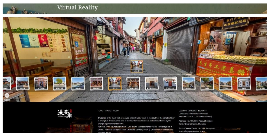
Figure 9. Zhujiajiao Virtual Tour.