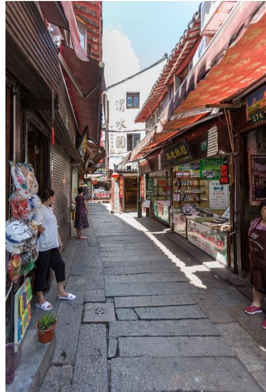
Figure 4. A typical lane of Zhujiajiao water town. Souvenir shops pullulate along the touristic path, representing an example of heritage commodification.

another significant feature: they are incorporated into the urban fabric, but they can be seen as both “distinctive from and integrated into the field” [64, 65]. Chow also remarked how the recent constructions in the outskirts of Zhujiajiao followed alien schemes, generating incongruent and imbalanced relationships with the historical parts.