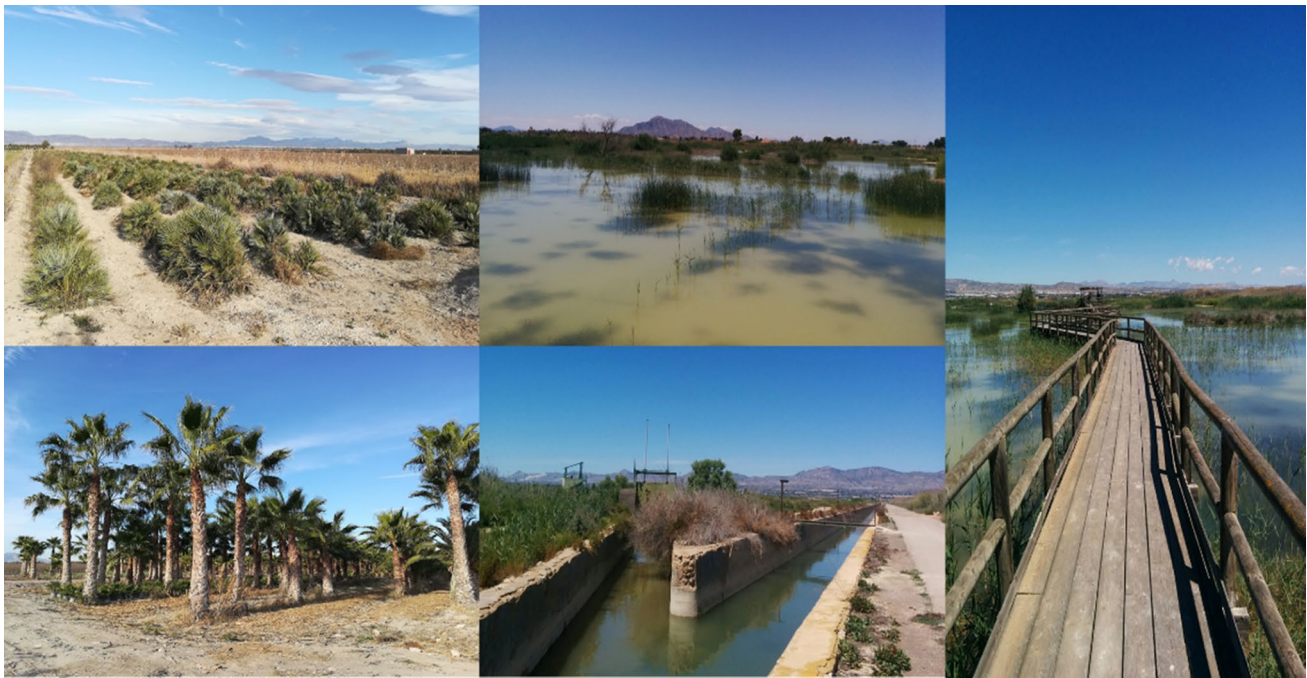
Fig. 2 Main water uses in El Hondo Natural Park: environmental, agricultural and recreational

conflict resolution (Godden and Ison 2019) because stakeholders' engagement incorporates a distinctly constructivist stance, focusing upon the meanings and values that individuals and communities attach to their physical surroundings and potential environmental harms, and the tactics and discourses mobilized to engage those meanings and values (Fisher et al. 2020).