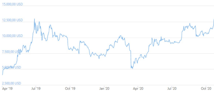
Fig. 1 Bitcoin value in USD on the period April 1, 2019–October 31, 2020

Independently of the rationale for the relation between Tether and Bitcoin, these papers suggest that Tether deserves a privileged position in cryptocurrency markets for trading reasons. We corroborate this interpretation showing that Tether introduced a structural change, separating the markets against Tether from the markets against US dollar. Our analysis suggests that it is the first group of markets that drives price formation, making the second group play a secondary role.