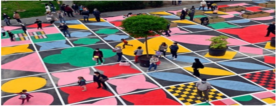
Figure 5 New York, USA: Activities in Open Streets (Street Lab, <u>n.d.</u>)

Milan, Italy: 'Quadra' an Interactive Tactical Intervention (BigSee, 2022)