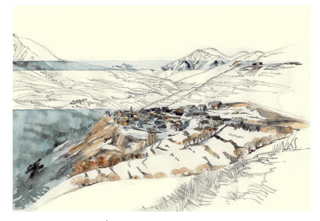
Figure 1. Véronique Simon, Écrins national park (2004, FR).

The selected photographers explore the "less picturesque" dimensions of the built and unbuilt landscape, focusing on different types of subjects and employing various techniques. Gabriele Basilico recurred to a method that attempted to "isolate" built elements from the quotidian movement hidden from our "confused and myope" gaze [27]. Basilico establishes this juxtaposition between the built environment and the other elements of the city to portray and document Milan's "functional" landscapes. Ernesto Fantozzi's approach contrasts with Basilico's technique. Instead of images devoid of people, Fantozzi portrays cultural and social expressions of everyday life in the emerging peripheral neighbourhoods,