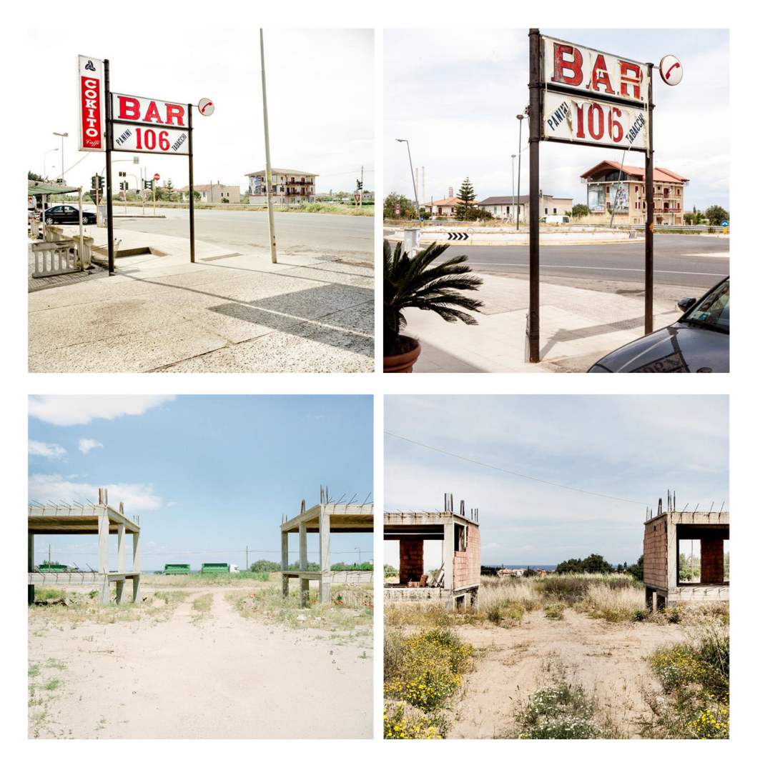
Figure 8. Filippo Romano, Statale 106 . Two images taken over time documenting changes in the built and natural landscape along the road. (2009–2019, IT).