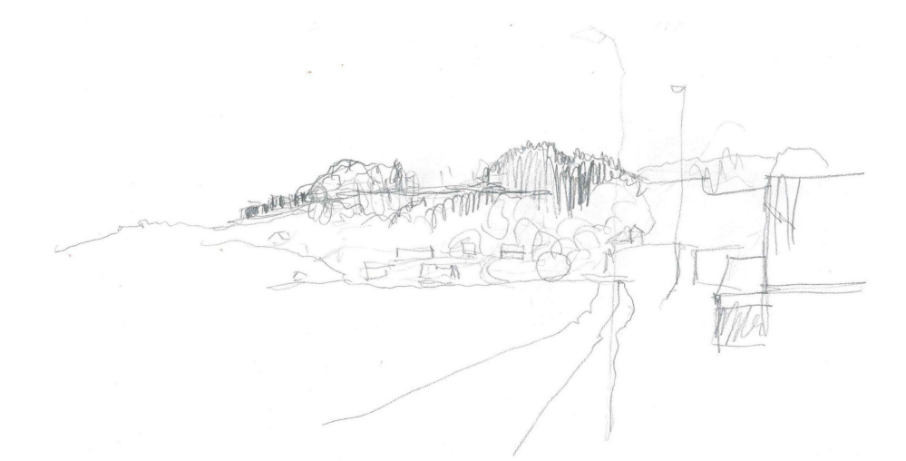
Figure 6. Ingfrid Lyngstad, Vennesborg : framing silhouette changing from recreational area to housing and sprawl (2022, NO).

Drawing is employed as a tool beyond its mere aesthetic value of documenting a landscape's beauty but as an instrument to capture the impact of local planning processes. For the landscape architect Ingfrid Lyngstad, drawing can become a documentation of "collective grief". The negative changes enacted on specific landscapes symbolized the omitted parts of the participation process. Lyngstad used drawings as part of a case study to show what the characteristic elements were and how they were going through phases of change (see Figure 6). In this case, the initial silhouettes set the basis for the narratives and values that appeared while studying these places [13].