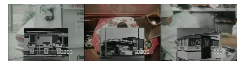
Figure 7. Jef Cornelis, Rijksweg N^{\circ}1 : gas station, still 0:13:45; brothel, still 0:15:12; chips shop, still 0:16:43 (1978, BE).

the bridge of Walem. The heavy traffic had come to a standstill at that time due to the arrival of the highway in the 1970s, leaving the landscape with a deserted appearance. Especially in the first chapters, the desolate atmosphere is emphasized by "silenced" images: figuratively, because there seems to be no trace of life, only a few people, and very sporadically, some traffic appears, but also literally, because there is no background music either. The human presence and background music gradually build up throughout the film. Despite this deserted atmosphere, this film creates a clear image of an arterial road with typical accompanying developments. The disordered edge, with its " Villas —' the prototype of the edge' — commercial buildings, gas stations, showrooms, brothels, roadside cafes, restaurants and homes [21]", is given extra attention in a separate chapter in the documentary (see Figure 7). After the visual summary of what the edge of the road entails, attention is also paid to the signs—"every building a sign that town or village does not exist [21]". By focusing on details such as flowerbeds, mailboxes, fences, and lowered shutters, the director emphasizes that there is no communal life along this road: " The road is not a place, the road is a connection from one place to another [21]".