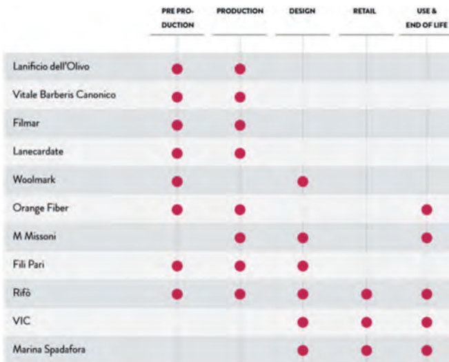
Chart 2 - Recurrent issues in the interviews. Red dots indicate in which interview each issue has been covered or touched