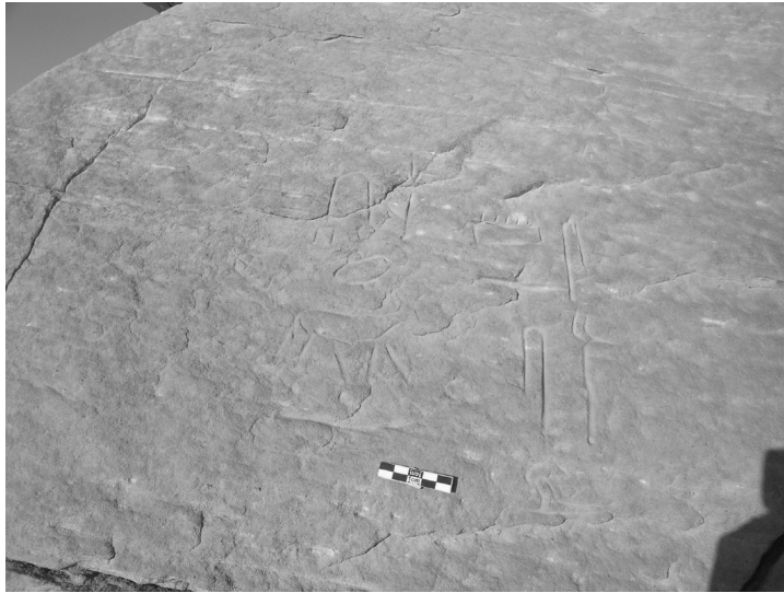
FIG. 2. Photograph of the Userhat inscription, in situ.

The inscription consists of two slightly unequal columns of hieroglyphs read from right to left, with the right column being slightly longer (figs 2 and 3). The right column reads: imn wsr h3t , while the left column reads: zš hzb k3(.w) . 6 A few faint, illegible signs of a different size from the inscriptions barely show above the upper right corner of the Userhat inscription, and might be the remains of an earlier text. The text can be read in three ways: first, the cattle-reckoning scribe of Amun-userhat; second, Amun-userhat, the cattle-reckoning scribe; third, if read in retrograde: the cattle-reckoning scribe of Amun, Userhat. 7