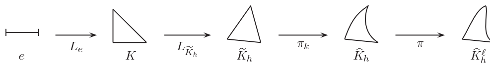
FIG. 3. Mappings used in the proof of Lemma 4.1.