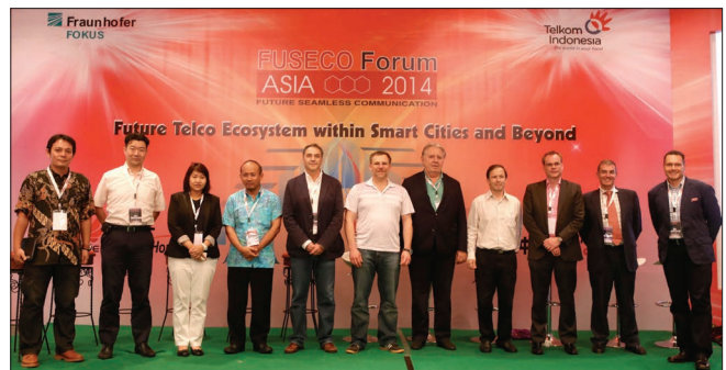
Impressions of the FUSECO Forum 2014.