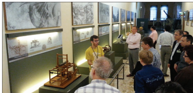
NOC 2014 attendees during the visit to models based on da Vinci's engineering sketches at the National Science and Technology Museum Leonardo da Vinci in Milan, June 5th, 2014.

free-space), and photonic devices. New topics such as optical mobile backhauling, optical interconnects, intra-datacenter networking, and software-defined optical networks have also been discussed.