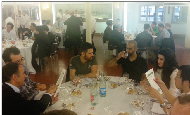
NOC 2014 conference banquet in the ballroom of "Conte Biancamano" trans-Atlantic liner, inside the National Science and Technology Museum Leonardo da Vinci in Milan, June 5th, 2014.

Through its technical program, the conference has provided an opportunity for the academic and industrial communities to meet and address new research challenges, share solutions, and discuss issues on optical networking and photonic equipment technology. NOC has addressed research topics in the optical networks area, such as core, metro, and access network planning design and modeling, optical communications (both fiber and