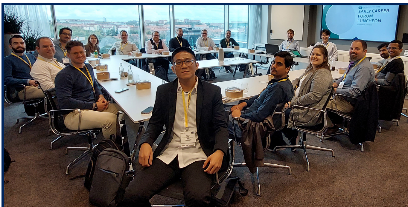
The Electrodeposition ECF Luncheon at the 244th ECS Meeting in Gothenburg, 2023.