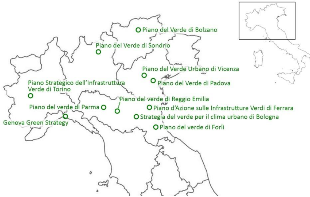
Fig.1 Localization of the green plans and strategies in Northern Italy

From the operational point of view, the survey has screened the official websites of the local governments to access and download the Green Plan documents.