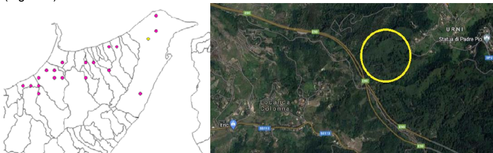
Figure 2 – Plant localization

The location of the plant is foreseen in an unprotected wooded area, sufficiently far from city centers, easily reachable through long-distance roads or suburban roads which if crossed by trucks do not affect city traffic (Figure 3).