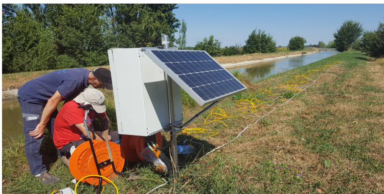
Fig. 1. G.Re.T.A. system in operation in San Giacomo delle Segnate, checked frequently through comparison with a portable instrument

The first installation of G.Re.T.A. system dates back to 2015 (Arosio et al., 2017, Hojat et al., 2020; Tresoldi et al., 2018, 2019). The monitoring system, that can now be applied in different studies (landslides, tailings dams, landfills, contaminated sites, agriculture, transportation embankments, etc.), was firstly designed and conceived for sustainable and resilient agricultural water supply. The system was installed on the levee of an irrigation canal in San Giacomo delle Segnate, in the district of Consorzio di Bonifica Terre dei Gonzaga in Destra Po (Fig. 1), using the Wenner array with unit electrode spacing of 1 m, obtaining a profile length of 47 m and a maximum penetration depth of 7.5 m. The aim was monitoring of concentrated seepages and leakages in the levee body as well as analysis of the influence of buried electrodes and meteorological variables on resistivity data.