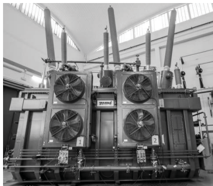
Figure 1: Tamini “green” transformer (ATR 15T037)

The product - the “green” 250 MVA autotransformer (Figure 1) - is an innovative environmentally sustainable and eco-efficient product, insulated with ester oil, and which commits to preserve environment and health, providing: