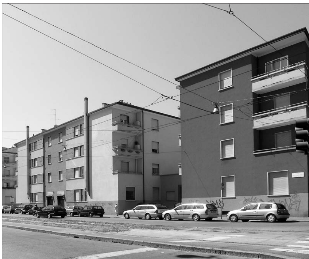
Ferdinando Zanzottera 2005 Quartiere San Siro Periferia di Milano - Italia