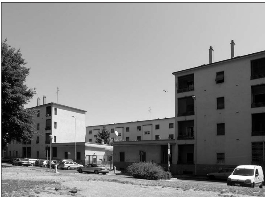
Ferdinando Zanzottera 2005 Quartiere San Siro Periferia di Milano - Italia