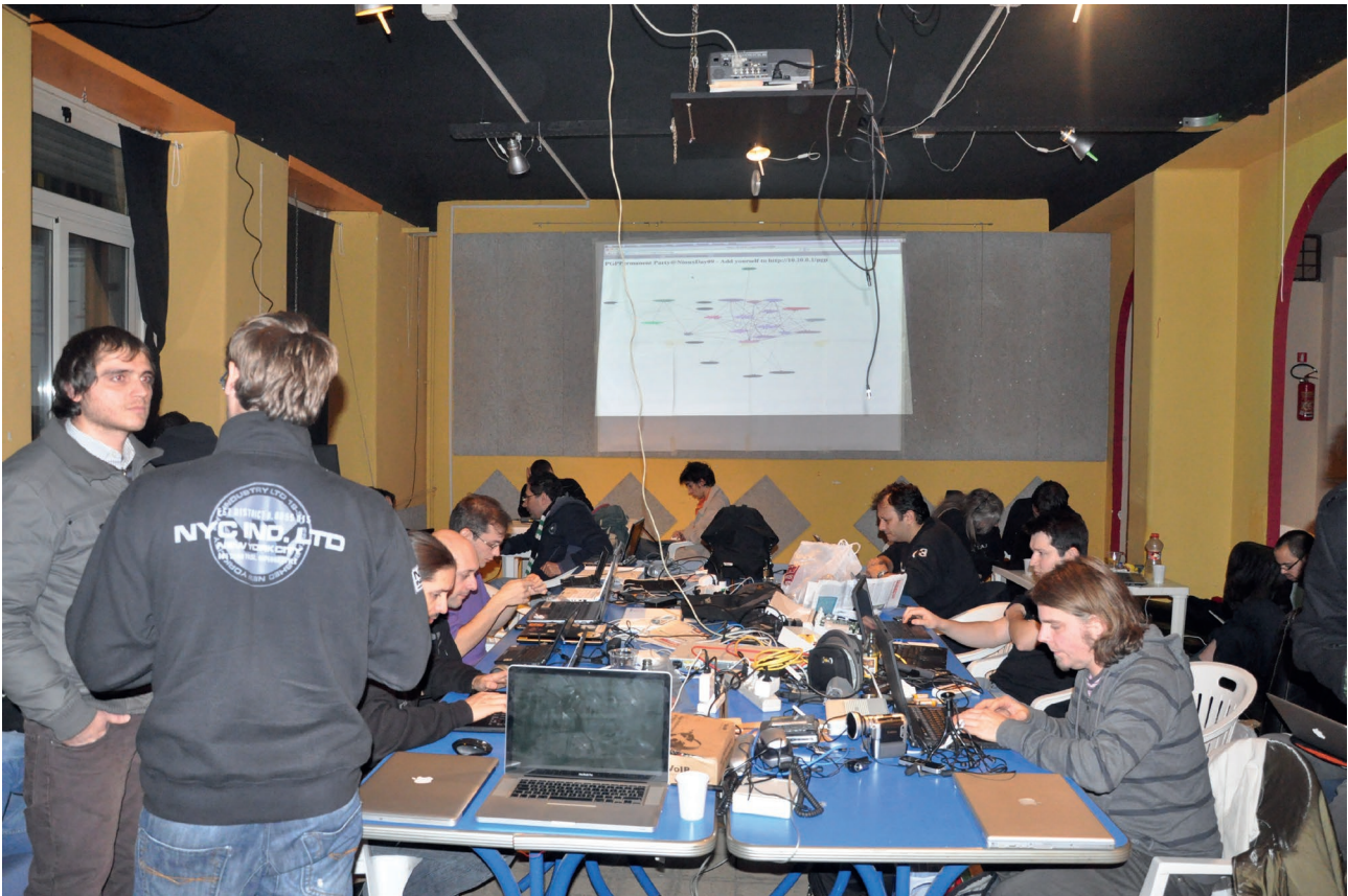
Fig. 2: A meeting of Ninux's coders

dimensions. We thus unraveled the intricacies of the mutual relationship between the various actors involved in the project emphasizing that the WCN is an emerging outcome from the cooperation of members involved in a process of mutual-learning and sharing of academic expertise and political outlooks. Indeed, contemporary innovation in infrastructures is increasingly characterized by a close relationship between experts and lay people. Taking into account this crucial aspect, we have shown that the shaping of grassroots infrastructures implies a processual and in-the-making work of creation and maintenance developed outside predictable and conventional innovation settings (Crabu et al. 2016).